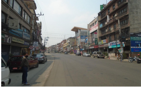
Lockdown Scene in Kathmandu