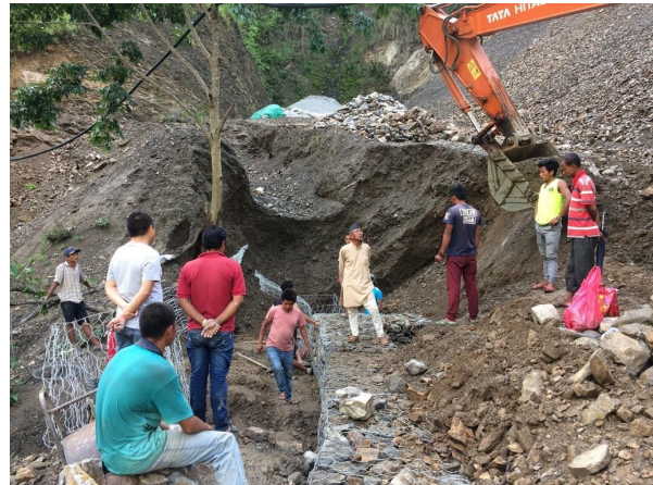
Road construction continues amidst pandemic in rural Nepal

I also place hope in communities' spirits of solidarity and compassion, as this has been a key source of resilience in survival and recovery from the disastrous 2015 earthquake. After the lockdown was eased on June 20, I visited a village in the Roshi rural municipality of the Kavre district, making sure that I adhered to the rules of social distancing, mask-wearing, and hand washing. From the conversations I had with the people, I realized that while the community is anxious about the uncertain situation presented by the global pandemic, they are also dedicated to community solidarity and do what they can to extend support to one another. As soon as the lockdown was imposed, families called back their relatives working in cities. With the return of young people to villages, the atmosphere in these places revived somewhat, regaining a welcome vibrancy. They plowed some of the abandoned terraces for maize and vegetable cultivation and village religious rituals continued with necessary precautions. When I visited the village, road construction was ongoing. Now they have restricted interaction with outsiders, but they are confident that they can still manage to support the relatives yet to return from abroad and are ready to welcome them back into the community.