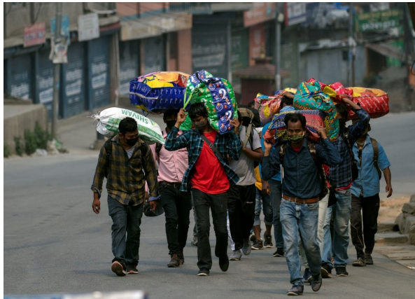
Wage workers from Bardiya, Kailali and Kanchanpur returning home by foot from Kathmandu after the government imposed lockdown