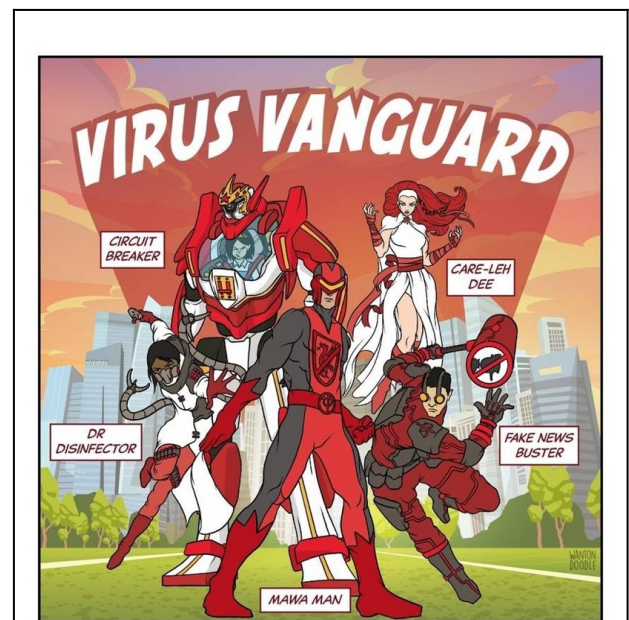
Superheroes removed after public

COVID-19 crisis as a political transition opportunity as much as a public health crisis. While other heads of state have prominently fronted their country’s public engagement, Lee slid into the background, forcing several ministers from the relatively inexperienced 4G cohort to take control” (Vadaketh, 2020). In those halcyon days, government officials and media outlets were still telling people not to wear masks unless they were sick, and threatening construction companies who sent their foreign employees to hospitals for COVID-19 tests due to a lack of supplies and an explicit choice to prioritize the rest of the population.