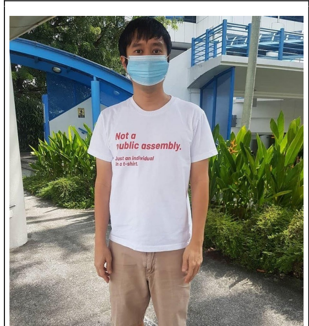
Migrant workers' activist who apologized to Minister Teo for wearing ironic t-shirt

Josephine Teo, the Minister of Manpower, was asked in Parliament if she might consider offering an apology to the migrant workers "given the dismal conditions that they are currently in". Betraying an extraordinarily flippant indifference to the structural inequality between her and her wards, who oscillated between fear of infection from their fellow dorm-mates and concern about deportation to even more chaotic circumstances, Minister Teo replied, "...I have not come across one single migrant worker himself that has demanded an apology" (Zhang, 2020).