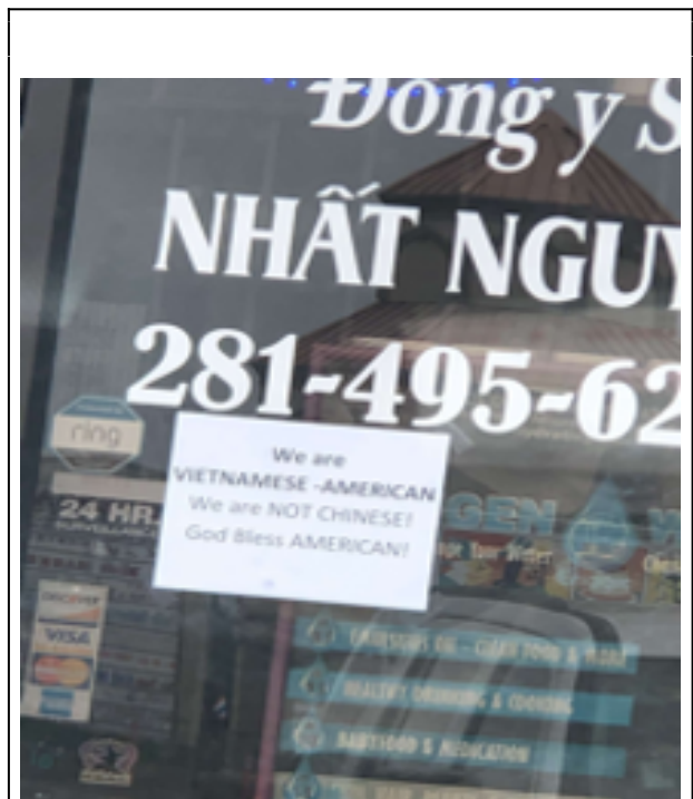
Sign announcing that the owners of this store are Vietnamese-Americans and not Chinese. (The image is from a screenshot of a post that was shared to Crimes

our own government's failure to respond in a timely and effective manner (Isenstadt, 2020). By blaming the Chinese, they were also making it so that those who appeared to be Chinese could be blamed in the US. Most Americans can't tell Asians and Asian Americans apart or differentiate us by our languages and histories. Because of COVID-19, anti-Chinese sentiments and racism became more common and casual. We were not Asians or Asian Americans, but Chinese. By calling COVID-19 the “China flu,” the “China virus,” and “Kung-flu,” casual racism against us became more acceptable. Some Asians even began selling shirts proclaiming, “Not Chinese,” which is problematic in other ways, or posting signs that they were Vietnamese and not Chinese. We were told to our faces to go home or had our property vandalized (Peng, 2020). We were targets of hatemongering and racist abuse in the United States and world-wide (Human Rights Watch, 2020).