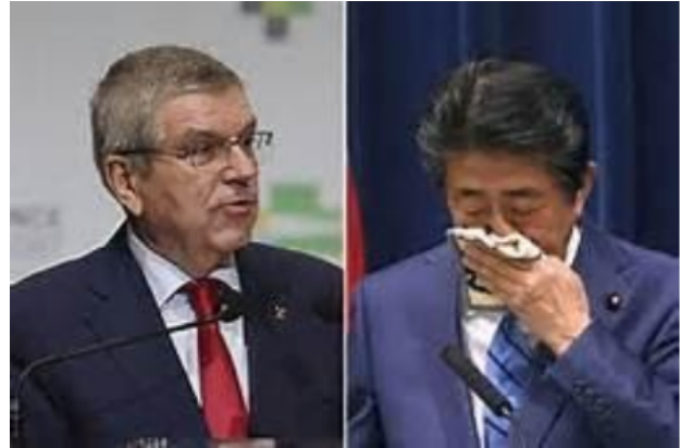
IOC Chairman Thomas Bach and PM Abe Shinzo