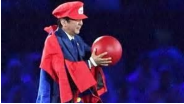
PM Abe Shinzo Hamming it up as Super Mario at Rio 2016 Olympics Closing Ceremony

There has been a devastating impact on the economy as the Nikkei stock average has plunged, the economy is contracting, and the once booming tourism sector is moribund. Everyone anticipates that the pandemic will inflict more damage to the economy and generate job losses that will hit households hard, and further dampen consumption, already reeling from Abe's ill-judged 2019 sales tax increase . COVID-19 defies easy predictions but does promise awful consequences that result from a profound crisis in global healthcare stemming in part from neo-liberal reforms and stark inequalities .