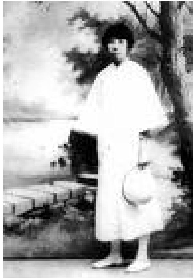
Image 3: 1926 photograph of Xu Guangping (1898-1968)

Inoue's portrait of Lu Xun focuses on the year 1934 in Shanghai when Lu Xun and his common-law wife, Xu Guangping (see image 3), took refuge at the famous Uchiyama Bookstore to avoid persecution as by the Nationalists (Guomindang) led by Chiang Kai-shek.