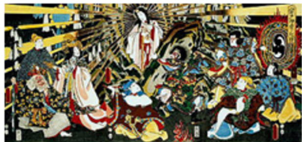
Amaterasu, the sun goddess emerging from a cave to bring light to the universe

Unfortunately, the influence of Nihonjinron on constructing social reality in Japan has often been overlooked by scholars more interested in trampling the ‘bleeding corpse’ (Gill 2001: 577) of a genre of writing that has come to represent something of a straw-man par excellence . As Reader (2003: 111) suggests, the central problem is that critics, perhaps “beguiled by the self-defining rhetoric of uniqueness that pervades nihonjinron”, have come to see such discourses as ‘unique’ to Japan while, at the same time, underestimating the particularities of Japanese culture. In fact, as the following sections illustrate, the opposite is in fact true: Nihonjinron, in the narrow sense of a discourse on national identity, is not unique but the historical materials it draws on and the national culture it helps to (re)create are.