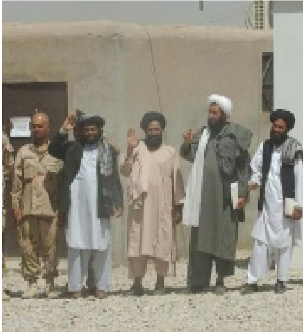
Karzai administration officials and Taliban rebels negotiate

Karzai also invited Mullah Omar to join him in the political process of Afghanistan by being hopeful for the next presidential election as Karzai reckoned Omar's return in the best interest of the prosperity and safety of the country. [emph. added]