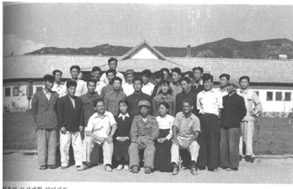
Korean and German workers in the Hamhung reconstruction project, late 1950s.

promise given by you, dear comrade Prime Minister, to our delegation at the Geneva Conference, to rebuild one of the destroyed towns by the efforts of the German Democratic Republic...The government of our Republic has decided as the object of reconstruction and recovery by your government the city of Hamhŭng, one of the provincial centers of our Republic. 13