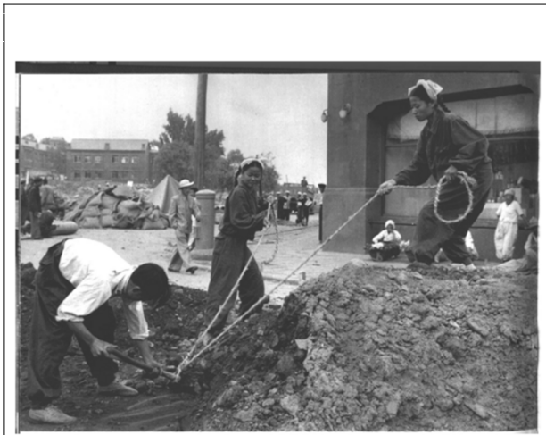
Rebuilding Pyongyang. From Chris Marker, Coreennes (Paris: Seuil, 1959).

would require all the work and resources the North Korean people could muster.