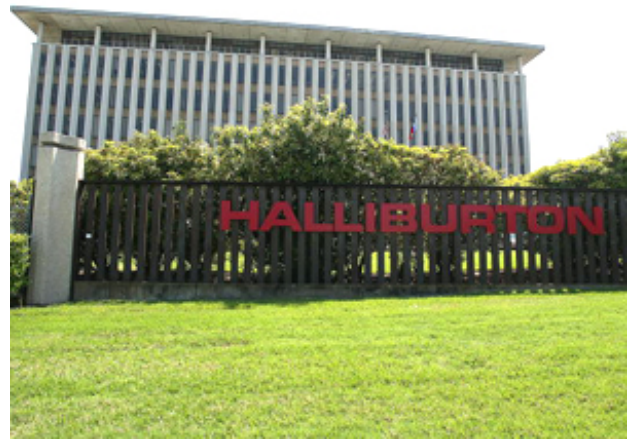
Halliburton Corporation's Houston offices

& Root), a subsidiary of the Halliburton Corporation of Houston.