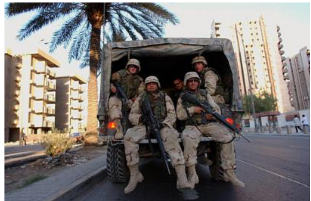
U.S. troop in Iraq

The total of America's military bases in other people's countries in 2005, according to official sources, was 737. Reflecting massive deployments to Iraq and the pursuit of President Bush's strategy of preemptive war, the trend line for numbers of overseas bases continues to go up.