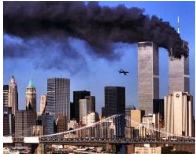
World Trade Center under attack on 9-11

What came to be known as "defense transformation" first began to be publicly bandied about during the 2000 presidential election campaign. Then 9/11 and the wars in Afghanistan and Iraq intervened. In August 2002, when the whole neocon program began to be put into action, it centered above all on a quick, easy war to incorporate Iraq into the empire. By this time, civilian leaders in the Pentagon had become dangerously overconfident because of what they perceived as America's military brilliance and invincibility as demonstrated in its 2001 campaign against the Taliban and al-Qaeda -- a strategy that involved reigniting the Afghan civil war through huge payoffs to Afghanistan's Northern Alliance warlords and the massive use of American airpower to support their advance on Kabul.