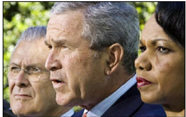
Former US Secretary of Defense Donald Rumsfeld, US President George W. Bush, US Secretary of State Condoleezza Rice

reality, many of the changes seemed to be determined largely by the Bush administration's urge to punish nations and domestic states that had not supported its efforts in Iraq and to reward those that had. Thus, within the United States, bases were being relocated to the South, to states with cultures, as the Christian Science Monitor put it, "more tied to martial traditions" than the Northeast, the northern Middle West, or the Pacific Coast. According to a North Carolina businessman gloating over his new customers, "The military is going where it is wanted and valued most."