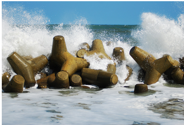
Concrete "tetrapods" on the Fukushima coast, used to minimise erosion

In the same year, the level of pollution of 24 per cent of Japan's coastal waters exceeded environmental standards, and enclosed areas in particular, such as the Seto Inland Sea, Ise Bay and Tokyo Bay are seriously polluted by household and industrial waste (Ministry of the Environment 2007).