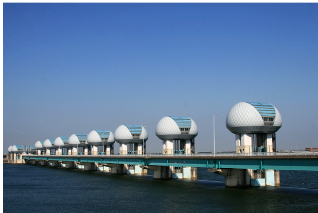
Nagara River, the last major river in Japan to be dammed - then and now. Top: As portrayed by Eisen in the 19th century. Bottom: Now - the “estuary barrage” at the mouth of the river.

The intensive use of agricultural chemicals since the Second World War has caused contamination of soil and waterways, and has made farmland, marshland and other lowland areas uninhabitable for a number of species, causing the extinction of some, including the Japanese crested ibis ( Nipponia nippon ). 7 Fertiliser and pesticide application levels in Japan are higher than those in almost