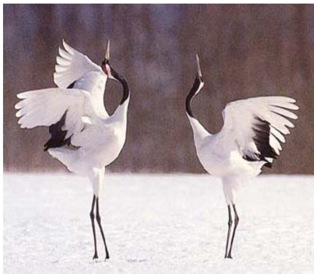
Red-crowned cranes of Hokkaido—the last

In addition to the failure to protect areas of ecological importance, direct habitat destruction is a major threat to natural habitats. Habitat destruction has taken many forms: deforestation; land reclamation; construction of dams and other riparian works; use of pesticides on agricultural land; development projects; and pollution.