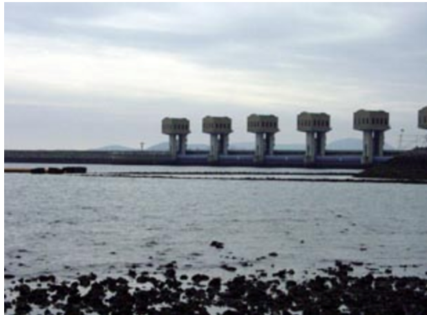
A section of the 7 km long sluice-gate across Isahaya Bay

was also an important stopover point for birds migrating between Siberia and Australasia. It made up six per cent of Japan's remaining tideland, and was habitat to about 300 species of marine life, such as the mud-skipper ( mitsugorō ), and approximately 230 different species of birds, including a population of Chinese black-headed gulls, of which only 2000 are estimated to remain worldwide (Umehara 2003).