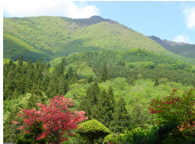
Mixed coniferous and regenerating indigenous forest in Tohoku

Japan's geographical isolation, diverse topography and climate has supported a high level of biological diversity. About 200 mammal species have been identified in Japan, compared to 67 in the United Kingdom and Ireland, an area roughly similar in size. Over 700 bird species, including sub-species, have been recorded, again approximately double the number found in United Kingdom and Ireland (Environment Agency 2000: vol.1, 285; Kellert 1991: 298).