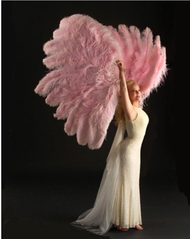
The great Sally Rand