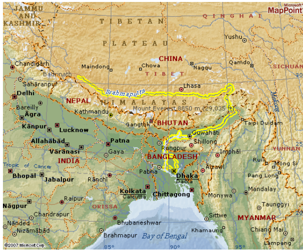
Yarlong-Tsangpo/ Brahmaputra River in Tibet and South Asia

damagingly accelerated by global warming.