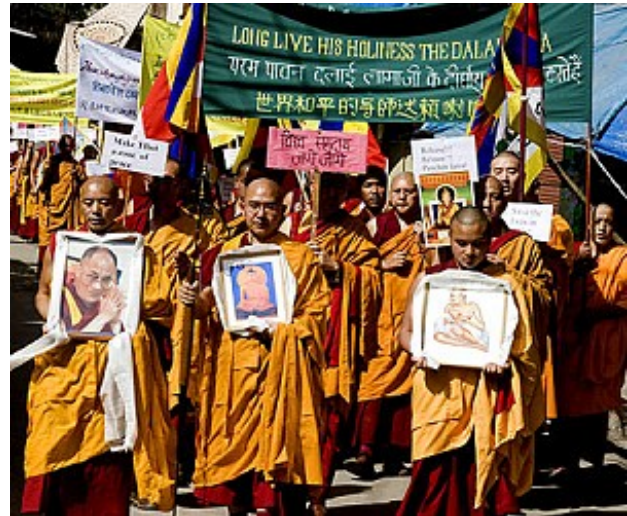
Tibetan monks in Dharamsala, India pray for demonstrators in Tibet, March 18, 2008

Certainly, Tibetan exile flags and "free Tibet" slogans were features of Tibet's biggest and most violent protests in decades, but it is simplistic to see the widespread discontent on the Tibet Plateau as a bid for freedom by an oppressed people. Protests in Lhasa began with Tibetan monks using the anniversary of the Dalai Lama's flight into exile (March 10, 1959) to peacefully demonstrate against tight religious controls, including patriotic education campaigns and forced denunciations of the Dalai Lama, but they were soon joined by ordinary Tibetans who used violence against non-Tibetans and their property. Victims included Muslim traders as well as Han Chinese.