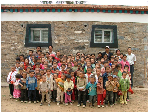
Tibetan school children at Jiangjia. School reconstructed with Finnish funds

A central problem is the high rate of illiteracy among Tibetans. While rates vary between the TAR and other Tibetan prefectures, and between urban and rural areas, ethnic Tibetans remain among the most illiterate in China. While enrolments have been rising, only a small minority of the total Tibetan population has some degree of secondary education. The national curriculum is highly academic, demands strong Chinese literacy, and is poorly adapted to rural and regional labor market needs. High school drop-out rates reflect the grim reality that investment in education is not rewarded by jobs, except for a tiny elite that are clever enough to continue to university and state jobs. More than 40% of Tibetans have no formal schooling at all, compared with China's national average of 8%. [4]