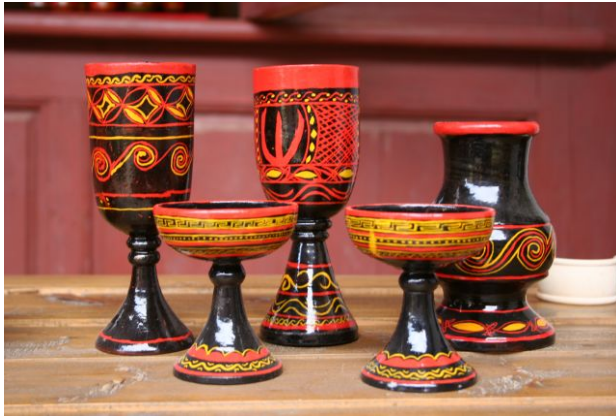
Crafts produced at the Eastern Tibet Training Institute

training, but only limited resources are allocated to it, especially in rural areas, and local governments are not given incentives to invest in it over the long term.