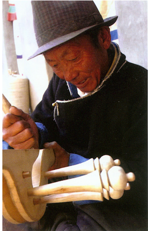
Tibetan artisan at work

confirms anecdotal evidence from local employers that Tibetans and other minorities can get jobs if they have the right skills.