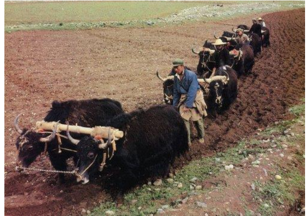
Tibetan farmers ploughing with yaks

Because of the rosy picture painted by official statistics and the state media, most Chinese are unaware that Tibetans have been among the big losers in the course of China's economic miracle, and that within Tibetan areas (both the Tibet Autonomous Region and Tibetan autonomous prefectures in the neighboring provinces of Qinghai, Gansu, and Sichuan), the pace of economic modernization has polarized Tibet's economy. While a minority of Tibetans have been rewarded with state jobs, the majority of Tibetans, who are poorly equipped to access new economic opportunities, have been marginalized.