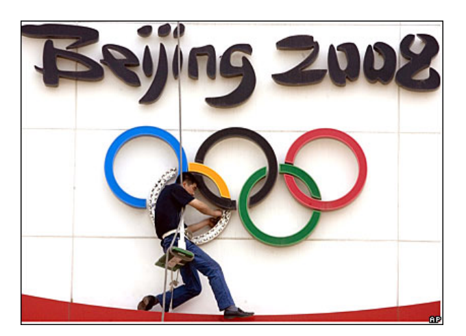
Beijing prepares for 2008 Olympics

As for the suggestion that if such an event can occur in China then China is not qualified to host the Olympic games, it is simply indicative of the shallowness of Japanese refusal to confront the serious problem we face.