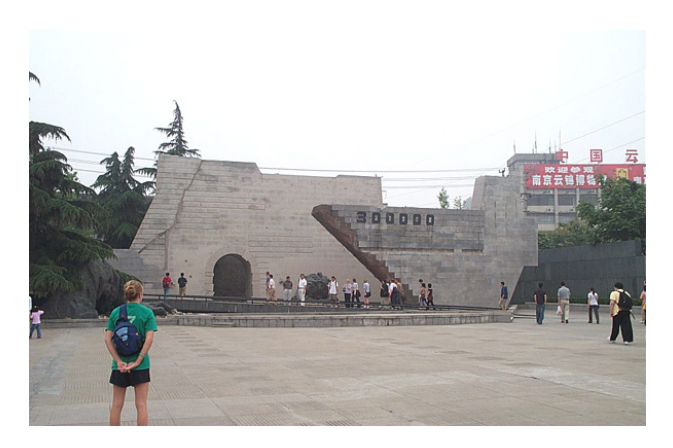
Memorial and Museum for Nanjing Massacre

The strengthening of nationalistic education in China can be traced back to the Japan's history textbook controversy of 1982. The importance of resistance to Japanese aggression in China's nationalistic education is clearly demonstrated by the construction of the Nanjing Massacre Museum in Nanjing and the Memorial Hall to the Chinese People's Anti-Japanese War immediately adjacent to the Marco Polo Bridge, site of the outbreak of the Sino-Japanese War. Both museums, their names written in glittering gold characters, were constructed under Deng Xiaoping's instructions. Japan's history textbook controversy stirs Chinese memories of Japan's war of aggression against China which unfolded after the May Fourth Movement of 1919. The May Fourth movement was not only directed against Japan's Twenty-One Demands, it is the very embodiment of China's nationalist movement. The fact that Japan has shown not the slightest sincerity toward learning from the past has fostered deep Chinese suspicion.