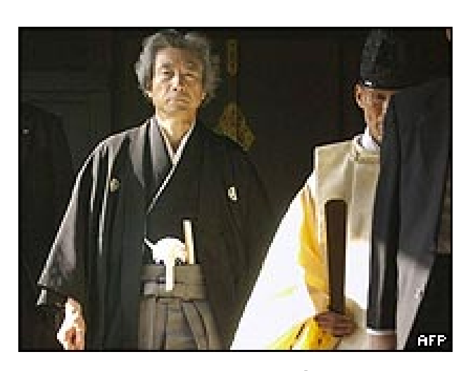
Prime Minister Koizumi at Yasukuni Shrine

Prime Minister Koizumi would never have visited Yasukuni Shrine at the start of 2004 if he had taken seriously the precariousness of relations with China and been aware of the importance of avoiding further deterioration in China-Japan relations. Nevertheless, the Prime Minister insisted on visiting Yasukuni Shrine as if no issue existed. The Chinese perceive Japan and the Japanese people as refusing to seriously recognize their responsibility as victimizers in the invasion of China.