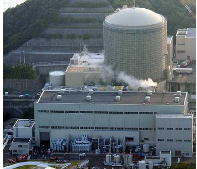
Steam billows from the Mihama nuclear power plant in a 2004 accident

The world has had to live for more than sixty years with the serious threat of nuclear devastation, a threat that is the result of the huge number of nuclear weapons that could destroy the earth several times over. Even as this danger continues, we also face rising nuclear proliferation threats caused by the diversion of peaceful nuclear programs to military use and withdrawals from international non-proliferation treaties and agreements, as well as the threats of nuclear terrorism and thefts of or illicit trade in nuclear materials by non-state actors.