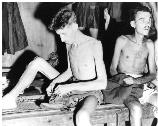
Released POWs at Aomori, Japan, 29-30 Aug. '45

So why were virtually all of Weller’s 1945 dispatches from Japan censored? Surely the prison camp stories would’ve played well back home, building the case against a brutal enemy—even if the Nagasaki reports each contained a dangerous radiation all their own, the unpredictable half-life of truth. Difficult as it may be to parse MacArthur’s motivations, it’s also hard to think of one good reason why the U.S. government might’ve wanted to encourage any correspondents outside their guidance to venture into the nuclear sites. After Wilfred Burchett’s one-day foray into Hiroshima, Weller was unknowingly sending his dispatches into a hornets’ nest in Tokyo, where he hadn’t a prayer of success. And after Truman’s confidential memorandum demanding silence about the bomb from all U.S. media, one week into Weller’s odyssey, anything that got through the censors would’ve still probably been silenced back home.