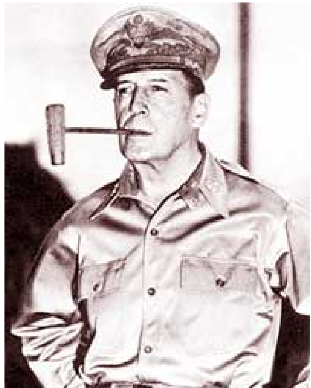
Gen. Douglas MacArthur