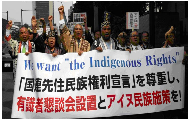
Tokyo: Mass Ainu March for Indigenous Rights, May 22, 2008