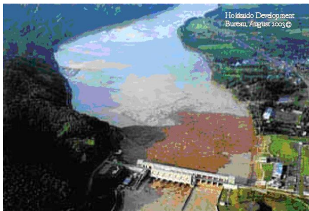
Aerial view of Nibutani Dam, nearly submerged by silt and driftwood during the 2003 typhoon

argue that they have a special mandate to address the global environmental crisis because they are directly dependent on the natural environment for their livelihood, experience immediate consequences when the environment fluctuates, and have observed and experienced global warming-related changes for decades.[49] Mitigation measures now being introduced to combat global warming have also adversely affected indigenous communities in what might be dubbed “neo-energy colonialism.” During the last century, indigenous peoples’ lands were targeted for fossil fuel extraction; now indigenous-managed lands are being targeted for corn, soybean, and oil palm plantations for bioethanol production. [50] Indigenous peoples are experiencing loss of traditional gathering and agricultural lands due to competition with biofuel plantations and hydroelectric dams. [51]