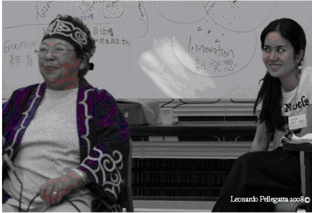
Ukocaranke on Education: Workshops lead to intergenerational discussion