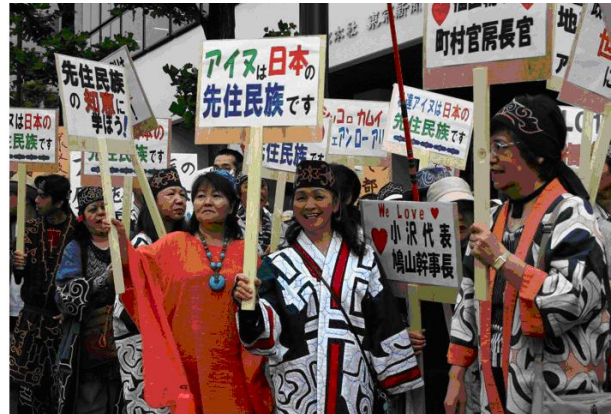
Ainu Women: A vocal majority for indigenous recognition

The Ainu Association also piloted initiatives that were reminiscent of campaigns to support the proposal for the “Ainu New Law” in 1984, which was substantially revised and adopted as the Ainu Cultural Promotion Act (1997), Japan’s first multicultural legislation. Focusing initially on Hokkaido legislators and later expanding to national coalition party leaders, the Association orchestrated visits to legislators, recruiting lawmakers to Ainu political rights work. In March 2008, their efforts bore fruit when the “Legislative Coalition to establish Ainu People’s Rights” was established to push for a resolution “recognizing the Ainu’s pride and dignity as indigenous peoples” ahead of the G8 meetings in July. [24] On May 22, the association coordinated a march on the nation’s capital, attended by more than 400 Ainu from across Japan. Adorned in traditional kimonos and waving placards anticipating the G8 environmental theme, “Ainu are kind to the earth” and “the Earth is on loan from our children,” the group marched toward the Diet buildings. Here Ainu Association directors formally read and delivered a formal request for indigenous rights to assembled lawmakers.