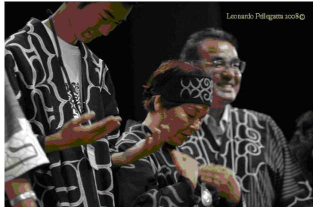
Gestures of thanks from the Executive Council at IPS Start

includes all Ainu...all Ainu communities in Japan, men and women, old and young, rural and urban.”[15]