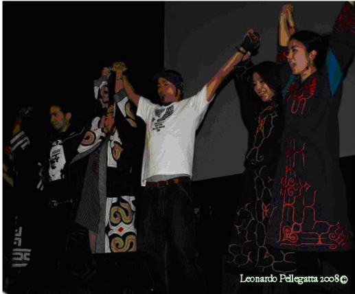
Resistance music: Ainu Rebels blend hip-hop and electronica to create a new Ainu vibe Leonardo Pellegatta 2008 ©

organized by young Ainu members of the Steering Committee, Ainu youth broke away from the politicized rhetoric of the summit to celebrate ethnic distinctiveness through performance, as an articulation independent of politics.