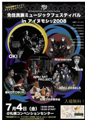
Indigenous Music Festival in Ainu Mosir 2008 poster