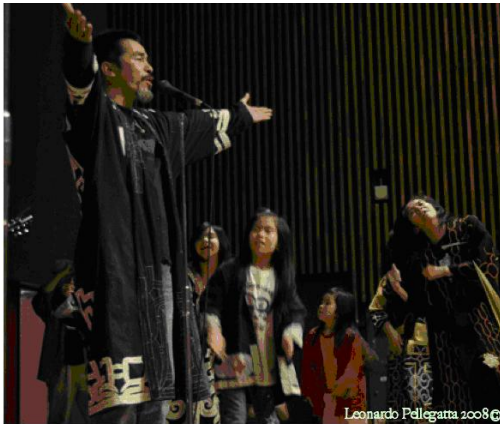
Ainu rock in the family: Ainu Art Project performs traditional songs with hard rock beat