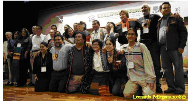
Indigenous Delegates and Aino organizers at IPS Opening

had a major ripple effect. This impacted not only Aino people but represents a big step forward for rights reclamation for indigenous people overseas as well." [7]