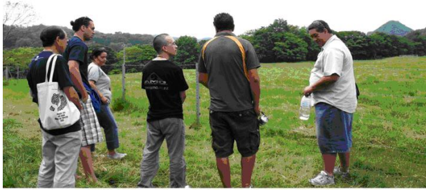
Maori delegation offers a prayer in respect for cinomisir and Ainu ancestors

Saru River Ainu communities for centuries. The proposed Biratori Dam was also a focal point of the Environment workshop. During the IPS fieldwork program, a local Ainu elder led a tour of the dam construction site.