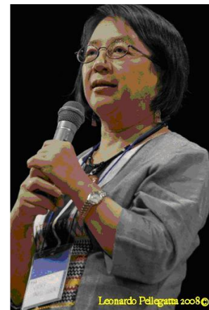
Tauli-Corpuz keynote on indigenous peoples and sustainability

Ainu alignment toward domestic action is in sharp contrast to the focus of IPS indigenous delegates who benefit from treaties and more progressive domestic policies. Many are involved with international organizing and trans-national ventures such as collaboration and leadership training; others serve as leaders of regional indigenous blocks and represent these constituencies in international contexts. They are therefore apprised of the techniques of international law and familiar with the vernacular of international legal-speak. Producing the Nibutani Declaration was an extension of ongoing work on the DRIP for international indigenous leaders.