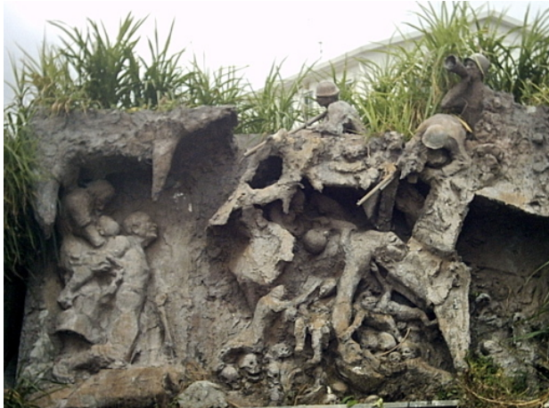
Okinawan sculptor Kinjo Minoru's relief depicting the horror of the Battle of Okinawa, during which many Okinawans were killed or forced to commit suicide after seeking refuge in the island's caves.