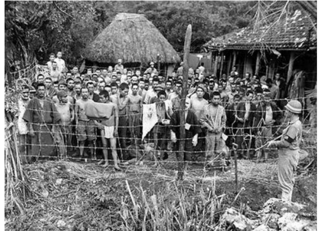
A Marine guards Japanese prisoners of war after the Battle of Okinawa.

The extreme fear of “brute Americans and British” [cultivated by the Japanese military] was a factor that made people choose death. Japanese military experiences of slaughter of Chinese people on the continent since the “Manchurian Incident” was widely discussed; and about the fate of residents at large at the time when the war turned out to be a “losing battle”, people despaired anticipating plunder, violence, slaughter by the American military. There were returned migrants who thought “the American military can no way be expected to kill residents”, but returnees were regarded as suspected spies and hence were unable to speak positively. To make such a statement was to court denunciation as a spy and slaughtered.