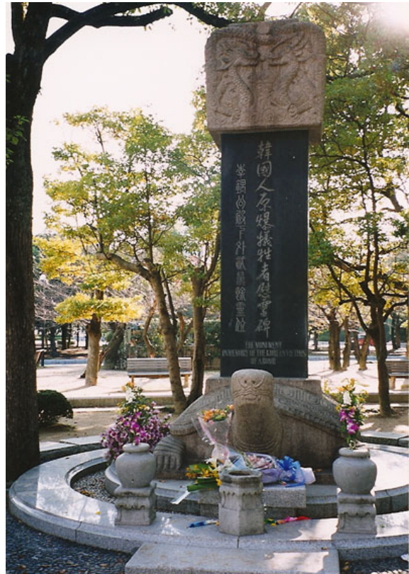
Memorial for the Korean victims of atomic bombing in Hiroshima

in the womb. Hibakusha are not only Japanese → there were also Koreans and Chinese forced laborers (kyosei renko) as well as allied POWs.