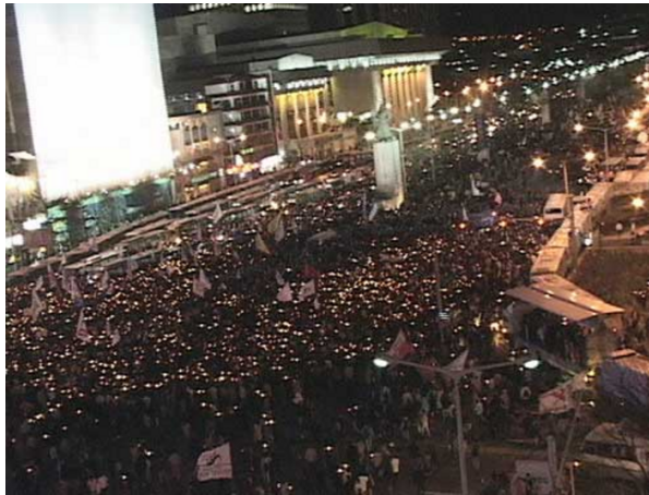
Candlelight vigil on December 7, 2002 surrounds US Embassy in Seoul

Amids USFK transformation and base realignment and consolidation in South Korea, local residents and activists once again joined forces to oppose the expansion of Camp Humphreys in Pyeongtaek. Figure 1 below indicates which bases were slated for closure and consolidation, emphasizing the closure of bases in and around Seoul and the opening of new bases in the far south.