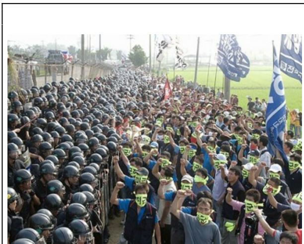
Farmers and workers protest at Pyeongtaek under the eyes of the military

Anti-base activists used a variety of strategies to publicize the Pyeongtaek base relocation project and challenge the state. Most visible were three major protests organized in Pyeongtaek in July and December 2005, and in February 2006.