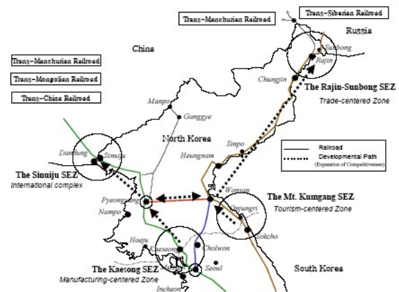
Figure 1. The Developmental Path of the North Korean SEZs

As a consequence, the proportion of the economically active population (15-64 year olds), which was 61.4 per cent in 2003, will rise to 62.7 per cent in 2010 and 64.0 per cent in 2020 before falling to as low as 53.7 per cent by 2050 (Donga ilbo 2005). This portends a declining labor supply. According to a report by the Korea Labor Institute (2005), Korea will face a severe labor shortage beginning in 2010. Assuming that Korea's economic growth averages 4.5 per cent and that there will be an annual 1.51 per cent increase in demand for labor during the next 15 years, there will be a shortage of 586,000 workers in 2015 and 1.23 million in 2020. A Bank of Korea estimate is even higher, projecting a shortage of up to 4.8 million workers in 2020 (Bank of Korea 2006).