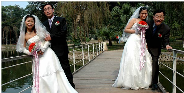
Korean men marry Vietnamese women in Vietnam

The proportion of intermarriages in total marriages in Korea has jumped more than ten-fold since 1990, accounting for nearly 14 per cent in 2005. This coincided with the growing number of migrant workers in Korea (see Table 2). The soaring number of international marriages is also due to a significant growth in the number of "picture brides" from abroad.