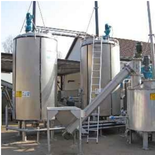
German solar technology

In spite of this multifaceted crisis and its implications for economic policymaking, the Japanese elite continue to hamstring the country in the midst of an incipient green industrial revolution. It takes a Bush-league scale of incompetence to toss away a lead in solar technology, as Japan has done. Japan axed its solar subsidy in 2005, and saw its market share slide. Meanwhile, the Germans in particular were making green technology the core of their domestic energy supply and world-beating export machine. Germany is now “accelerating its efforts to become the world’s first industrial power to use 100 percent renewable energy - and given current momentum, it could reach that goal by 2050.” [link]