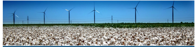
Roscoe wind farm, Texas

strong foundation for federalizing America's localized green revolution. Keep in mind that Texas has become a world leader in wind power thanks to a Renewables Portfolio Standard that Bush signed in 1999, when he was Governor. [link]