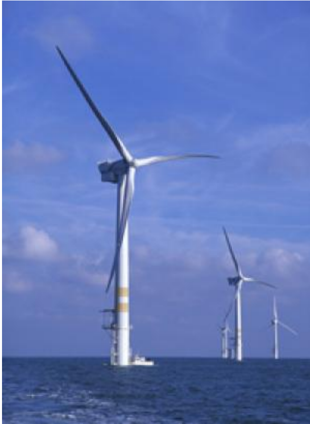
German wind power

We also learn that China, which has been making headlines as a menacing polluter in step with its surging oil and coal consumption, is rapidly emerging as a leader in renewables, and may be the world's top-runner in a few years. China has 65 percent of global capacity in solar thermal for heating water (40 million systems in place), annual doubling of wind-power capacity, and a skyrocketing production and use of solar power. If China's global search for oil and natural gas has driven up the prices of these fuels, Chinese research and production seem likely to drive down prices for solar and other renewables, thus making their diffusion even more rapid and widespread than at present.