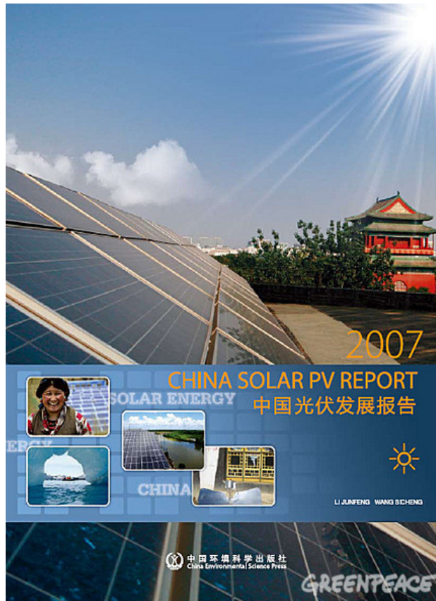
Solar pv, China