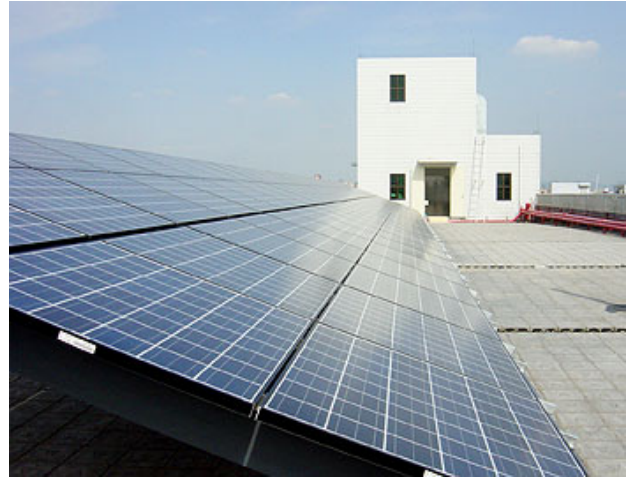
Chinese solar power

We also learn that China, which has been making headlines as a menacing polluter in step with its surging oil and coal consumption, is rapidly emerging as a leader in renewables, and may be the world's top-runner in a few years. China has 65 percent of global capacity in solar thermal for heating water (40 million systems in place), annual doubling of wind-power capacity, and a skyrocketing production and use of solar power. If China's global search for oil and natural gas has driven up the prices of these fuels, Chinese research and production seem likely to drive down prices for solar and other renewables, thus making their diffusion even more rapid and widespread than at present.