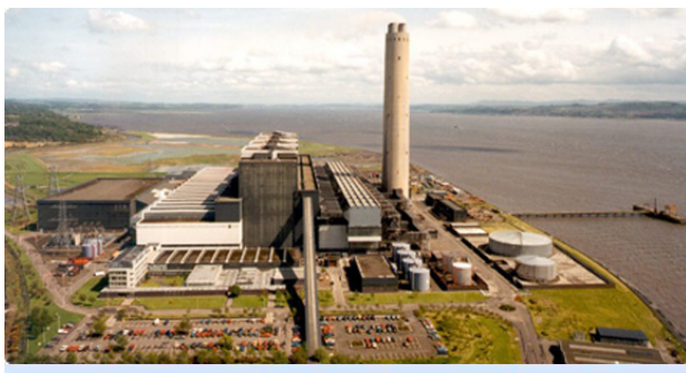
Biomass power, Scotland

Global capacity of small hydropower and biomass power came to 73 GW and 45 GW respectively by the end of 2006. Solar thermal for power generation is another promising technology that is again seeing growth, with new projects in the United States and Spain. And solar thermal for water heating continues its rapid rise. Rooftop solar collectors now provide hot water for more than 50 million households worldwide.