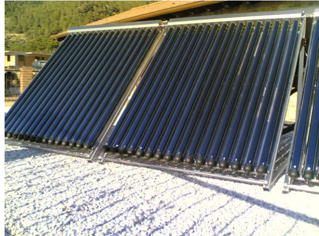
Solar thermal collector, China

First, China continues to lead the world in production and use of solar thermal for water heating, with more than 65 percent of global capacity by the end of 2007. Today, more than one-tenth of China's households rely on the sun to heat their water. China has more than 40 million solar thermal systems in place.