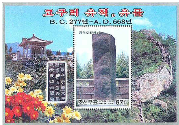
Koguryo tombs. DPRK stamp