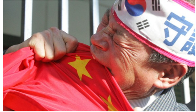
South Korean protester at the Chinese embassy in Seoul, 7 September 2006

Needless to say, few people in Korea accepted that these new actions of Chinese researchers were merely the result of academic curiosity, and general outrage followed. Noisy demonstrations took place in front of the Chinese embassy. Some ultra-nationalists even bit, chewed and then burned a Chinese flag in front of the cameras. President Roh decided to raise the issue during the recent summit with the Chinese chief executive, and Korean newspapers of all persuasions ran articles very critical of the Chinese positions. China’s actions were widely seen as a unilateral breach of the 2004 agreement.