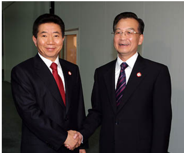
Roh Moo-hyun and Wen Jiabao in Helsinki

In Helsinki on 10 September 2006, South Korean President Roh Moo-hyun met Chinese Premier Wen Jiabao. Since the summit took place when the two leaders were attending the ASEM forum, they did not have much time to talk, so they had to concentrate on the most important issues in bilateral relations.