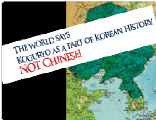
Korean response to China's world heritage proposal