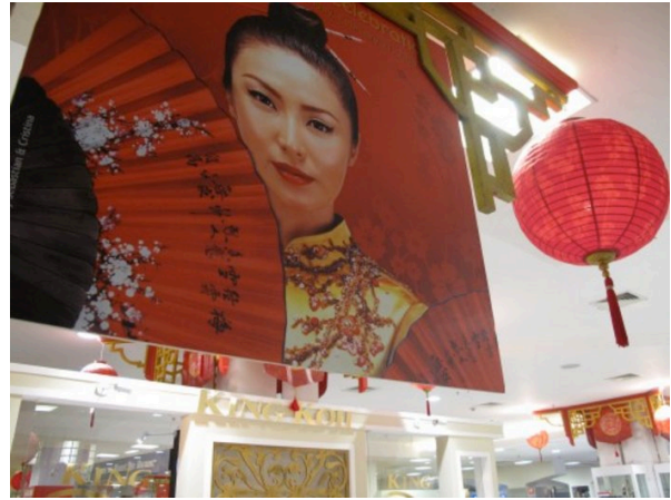
Commercializing the spring festival

One could easily point out that the capital city's businesses are using Spring Festival to increase sales and that - as is so common in Indonesia - everything is about money and very little about culture or history. On the other hand, one could say that while not everything is going smoothly (there is heavy security at all Chinese events - proof that not everyone welcomes the return of some cultural pluralism in this archipelago where the majority and its dominant religion are accustomed to rule unopposed), at least it is going!