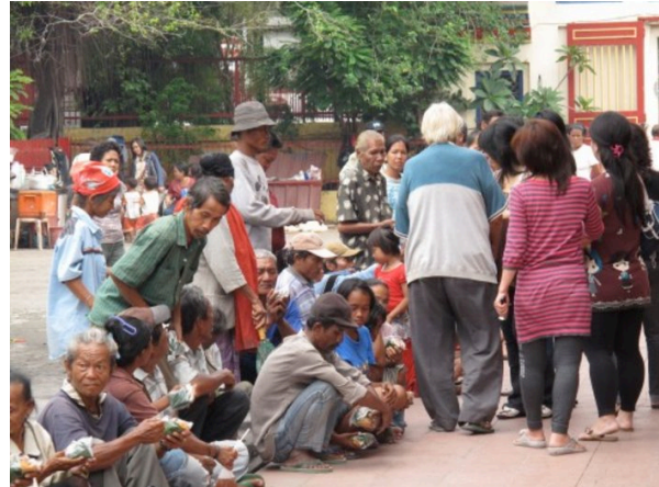
Chinese feeding Indonesian beggars

As he speaks, the sound of prayers is coming from the temple. Dozens of beggars, many old and some small children but none apparently of Chinese descent, are lining up along the access road asking for money or food. Chinese men and women are taking boxes of food and donations from the temple, distributing gifts equally among the growing crowd dressed in rags.