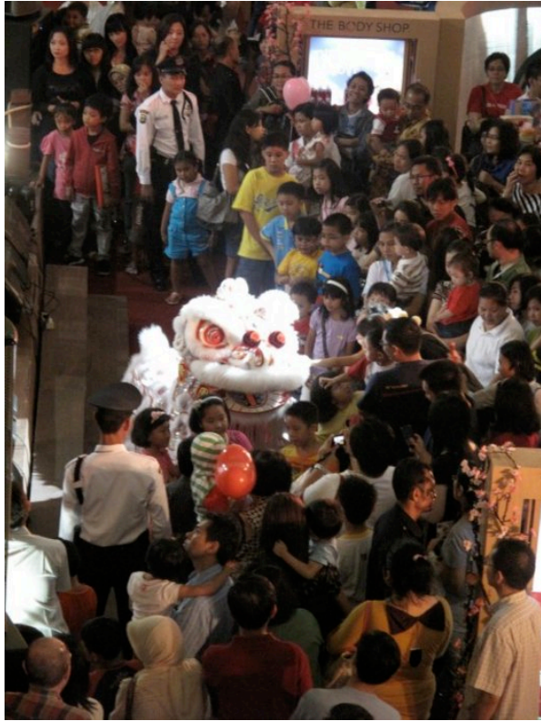
Children admire a lion dragon

The Year of the Tiger was being welcomed by lavish celebrations in several shopping centers, five star hotels and in some predominantly Chinese neighborhoods. Cultural events included traditional dances and music, as well as Chinese pop. At Taman Anggrek Mall this year's theme was Boat of Fortune with a huge 'junk regatta'.