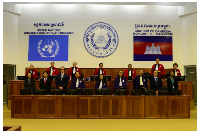
Figure 2: The ECCC trial chamber.

Purists: For legal purists, law has an important but narrow function: ‘to render justice, and nothing else’, as philosopher Hannah Arendt (2006) put it. Arendt made this claim while expressing reservations about Israel’s politicization of the 1961 trial of Adolf Eichmann, the Nazi bureaucrat who oversaw the deportation of Jews to ghettos and death camps. Doing otherwise, Arendt warned, would