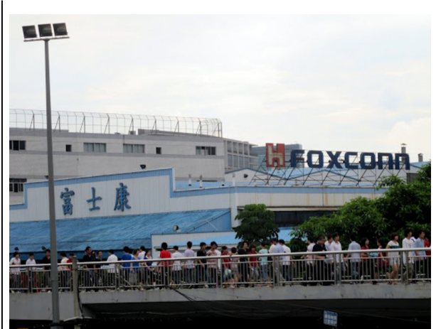
The majority of Foxconn's more than one million workers are rural migrants and teenage student interns. Fushikang, headquartered in Taipei (registered as Hon Hai Precision Industry Company), literally means "wealthy" and "healthy" in Chinese. Photographs taken during field trips to Guangdong and Sichuan (2011-2014).

Our primary research is based on multiple fieldtrips to Foxconn's largest assembly facilities in Sichuan (Chengdu City) and Guangdong (Shenzhen City) between 2011 and 2012, and follow-up visits in Shenzhen in August 2014, supplemented with inquiries made to senior company executives between December 2013 and April 2014. 1 Drawing on interviews with 38 interns and 14 teachers, who were dispatched from eight vocational schools (based in Sichuan and Henan provinces) to Foxconn factories for internships, we also conducted documentary analysis of the Henan government's major policies on student internships and employment. There has been scant scholarly attention to student interns as temporary or contingent labor, leaving unexamined an important dimension of the precarity of Chinese labor that is the product of the triangular relationship linking capital, the local state, and vocational schools in internship programs. In the following we review the changing labor market and ongoing legal reforms and structural transformation in China. We then present the findings of our study of the Foxconn internship program, and conclude by assessing the corporate and government responses to student labor abuses.