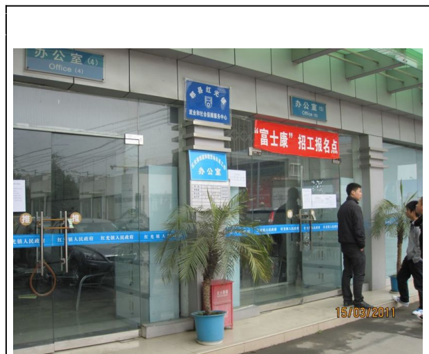
A government employment and social security office converted into a Foxconn recruitment station at Hongguang Town, Pi County (in Chengdu City, Sichuan). Local states subsidize the growth of private business with free hiring services and cheap labor supply.

The Sichuan provincial government prioritized helping Foxconn as its "Number One Project." It offered Foxconn partial funding to construct its gigantic production complex and 18-story dormitories. In addition to the construction projects, it undertook large-scale recruitment of student interns and workers at new Foxconn factories (there are two mega production sites of Foxconn Chengdu), leaving other Taiwanese manufacturing competitors such as Wistron and Compal far behind ( Global Times 2012). Local education bureaus pitched in by compiling and updating lists that identify vocational schools suitable for linking to Foxconn internship programs. All qualified schools were required to participate in recruitment.