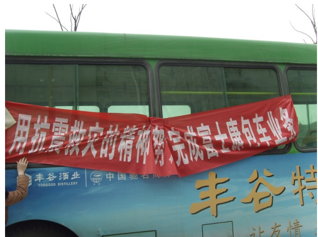
50-seater public buses line up for Foxconn (Chengdu) in Pi County, Sichuan. Drivers provide transportation service to Foxconn at government discounted rates. Government-printed banners on the sides of the buses read, "Use fighting spirit to overcome earthquakes and natural disasters to provide transportation for Foxconn."

Foxconn, given its powerful market position, gains access to numerous resources with strong government support all over China. In