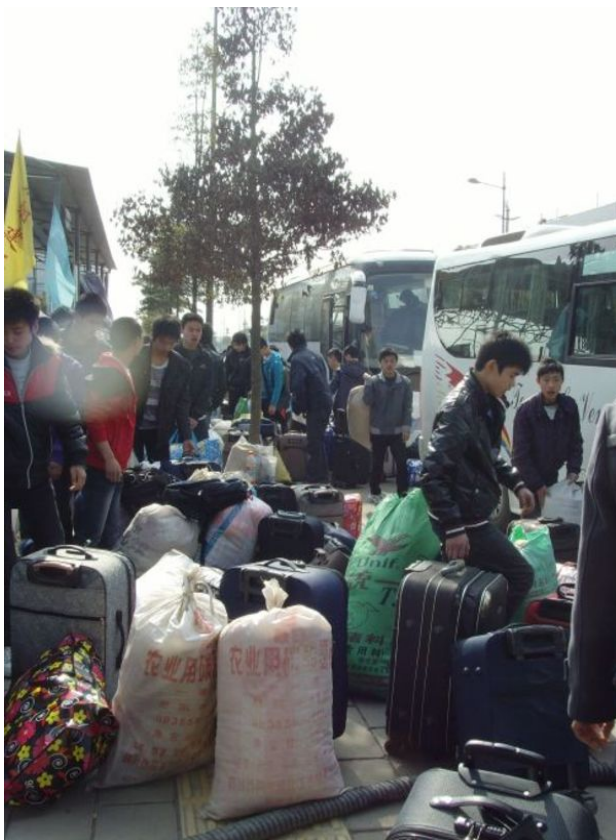
Foxconn Chengdu's newly built 18-story factory dormitory, Block 2. Teachers are housed in dorm

rooms next to their students to strengthen control during the off-work hours throughout the "internship."