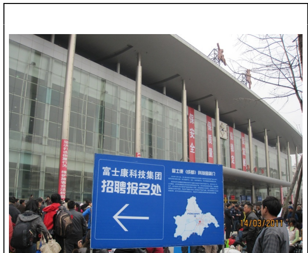
A recruitment poster introducing the corporate background of Foxconn (Chengdu) is displayed outside the Chengdu rail station, Sichuan. Since October 2010 Foxconn (Chengdu) has produced iPads exclusively for Apple. In one semester during 2011-2012, it employed more than 7,000 "student interns" on the assembly line.

interns, at Foxconn Chengdu are engaged in making iPads exclusively for Apple. Between September 2011 and January 2012 (a school semester), in Foxconn's Chengdu factories, more than 7,000 students—approximately ten percent of the labor force—were working on the assembly line (Interviews with human resources managers and teachers in December 2011 and January 2012). One of the participating schools, Pujiang Vocational School, sent 162 students on 22 September 2011 to undertake three-month internships that were subjected to extension in accordance with iPad production needs. The large Pengzhou Technical School signed up 309 students, accompanied by three male and three female teachers during the entire internship. This is typical of the 1:50 teacher-student ratio maintained throughout the Foxconn Chengdu internship program in 2011-2012. Contrary to our findings, the Apple-commissioned factory inspector Fair Labor Association "found no interns had been engaged at [Foxconn] Chengdu since September 2011" (our emphasis) (Fair Labor Association 2013, 5). 7