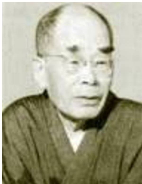
Fig. 1 - D.T. Suzuki

The always contentious, sometimes highly emotional, debate over D.T. Suzuki's relationship to Japanese fascism continues unabated. Among other things this is shown by reader reactions to a recent article in Japan Focus entitled "Zen as a Cult of Death in the Wartime Writings of D.T. Suzuki ( https://apjff.org/-Brian-Victoria/3973 )". This debate can only intensify by the further assertion of a wartime relationship between D.T. Suzuki and the Nazis or, more precisely, a positive or sympathetic relationship between Suzuki and the Nazis. This article, in two parts, will explore that possibility though conclusive proof of such a relationship will not be included until the second part.