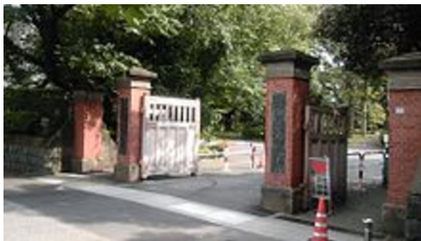
Fig. 9 – Entrance to Gakushūin

As we have seen, Suzuki was clearly opposed to Russian-style, or Soviet Communism. Yet, there is no compelling evidence to suggest he abandoned his socialist sympathies following his return to Japan in 1909. One sign that he maintained them was his support for educational reform while teaching English at Gakushūin, the ultra-conservative “peers school” for the children of Japan’s aristocratic families. Lacking evidence to the contrary, Suzuki might best be described as a “closet socialist” following his return to Japan. Yet, even if this were true, how might it help to explain a possible sympathy for the Nazis?