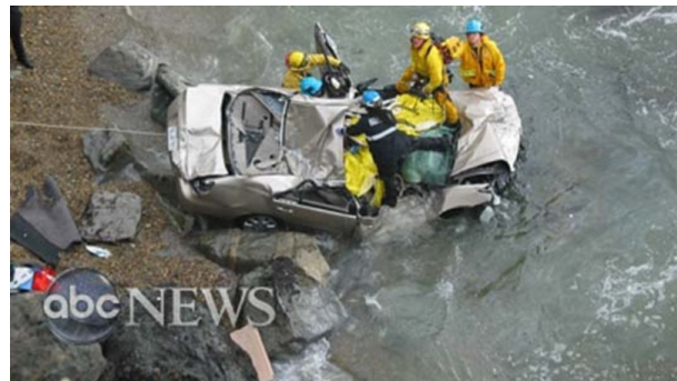
Reporting on Toyota acceleration crashes