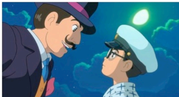
Horikoshi and Caproni

At school, the young Horikoshi borrows an English airplane magazine from a teacher. The volume tells the story of Caproni, an eccentric Italian airplane designer who becomes the boy's idol and advisor through a series of dream dialogues, exhorting Horikoshi to give his all to airplane design. Caproni's story reflects Horikoshi's eventual path – the Italian built bombers during World War I, while dreaming of constructing a massive trans-Atlantic plane in peacetime. The tragedy of engineers who married their design ambitions to military production is at the heart of Kaze Tachinu