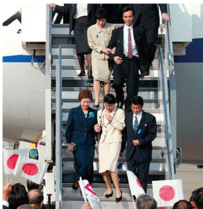
Picture 1: The Return of the "Pyongyang Five" (15 October 2002).

Hence, as is well known, Koizumi's overture of normalizing relations with Pyongyang was soon torpedoed by Japanese reaction to Kim Jong Il's revelation of the North's long suspected abduction of thirteen Japanese nationals, of whom eight have been declared dead by Pyongyang. 3 While Pyongyang hoped that an official apology would put an end to the abduction issue, the revelations immediately caused public outrage and anti-DPRK resentment in Japan. In Japanese eyes, North Korea failed to provide convincing evidence regarding the fate of the remaining eight abductees. Thus, the issue remained, and continues to remain, a logjam in the normalization of Japan-DPRK relations. Moreover, Tokyo's exclusive focus on the kidnappings has restrained Japan's diplomatic space for manoeuvring within the working groups of the Six Party Talks framework launched in August 2003 adding to the malfunctioning process of security multilateralism in Northeast Asia. 4