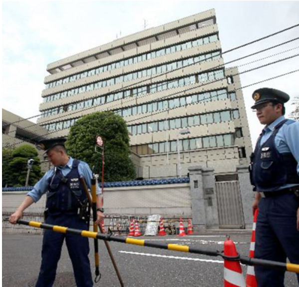
Picture 3: Chongryun Central Headquarters, Tokyo.

Pro-Pyongyang groups in the Zainichi community are the chief target of Japanese pressure. The abduction lobby and right-wing eliminated preferential tax treatment of pro-DPRK organizations. For example, in December 2003 then Tokyo governor Ishihara ended Chongryun's tax exemptions. In February 2006, the Fukuoka High Court ruled that the Kumamoto Korean Hall owned by Chongryun in Kumamoto does not benefit the general public and is therefore not eligible for exemption from local taxes. 46