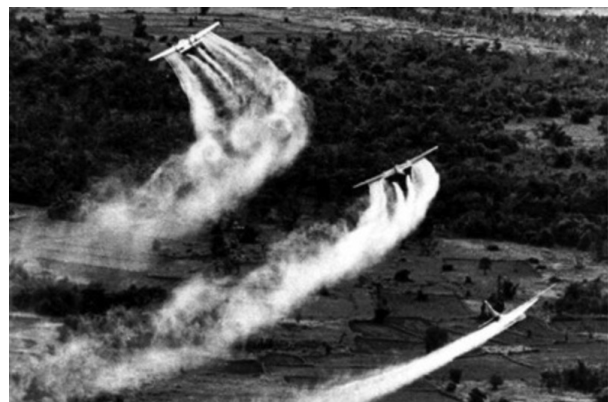
US Air Force planes spraying in densely forested area of Vietnam, 1966