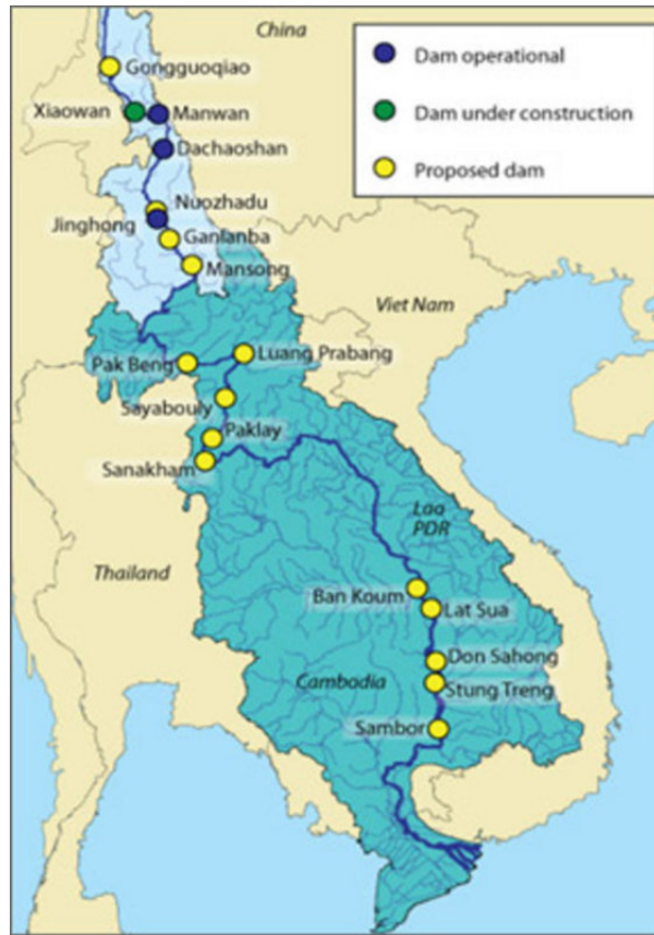
Chinese dams and proposed dams on the Mekong in China (light blue) and Laos and Cambodia, 2010

Wade, for example (2010: 3), talks about China's "bridgehead strategy" of building transportation infrastructure linking to Southeast Asia, a course that is producing myriad roads, railroads, and harbors. Precisely such a bridgehead strategy can be seen on numerous Chinese borderlands, notably in the Northeast (Russia, North Korea, South Korea, and, across the sea, Japan), in South Asia (India, Pakistan, Bangladesh), and Central Asia (Kazakhstan, Russia, and other former Soviet territories). 6 The economic and geopolitical implications of the expanded transportation links on China's borders are profound.