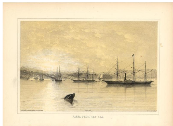
Perry's ships in Naha, Ryukyus in 1853

According to one story, probably apocryphal, as King Sho Tai in 1879 surrendered Shuri Castle to the superior force of the Meiji government, he uttered the words “Life is precious” (Nuchi du takara). These words later came to be understood as a core statement of Okinawan moral value, and the catastrophe that swept over the islands in the 1945 Battle of Okinawa was taken as confirmation of their wisdom. In the face of oppression, militarism, and colonialism the Okinawan people struggled to preserve the ideal of the supremacy of life over death, peace over war, the sanshin (samisen) over the gun.