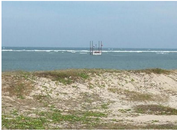
The first nuclear power plant will be built on this site in Ninh Thuan Province in southeastern Vietnam