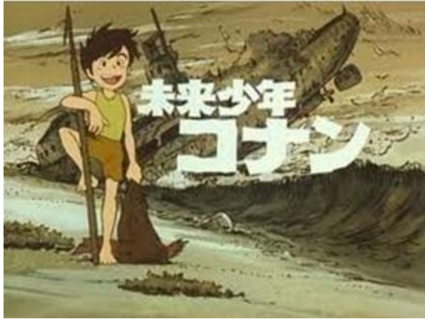
Self-reliance after civilization's end in Future Boy Conan

Miyazaki takes this convention to extreme lengths. After Conan , and in tandem with setting up his own animation studio, Studio Ghibli, the director has gone on to produce a number of apocalyptic films that are memorable both for their varied explorations of catastrophe as well as for their use of child or youthful protagonists, (not to mention their enormous box office success). One of the director's most beloved films, Nausicaa of the Valley of the Wind ( Kaze no tani no Nausicaa , 1985), is set in a thirtieth century post-apocalyptic world in which a young princess must not only stop her fellow humans from unleashing further technological catastrophe but also has to calm a herd of gigantic insects before they inflict devastation on what is left of the world. In his 1986 film Castle in the Sky; Laputa boy and a girl come close to sacrificing themselves in order to prevent the development of a technology of annihilation. His 1997 movie Princess Mononoke ( Mononokehime ), goes back in time to envision a fourteenth century Japan in