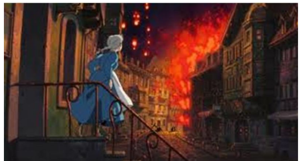
Firebombing of civilians in Howl's Moving Castle

Whether we still need to debate the question of quality, and I think that is a legitimate question, the fact is that popular culture is important on the most basic level because it is popular . Examining a popular culture product therefore means that we can be sure that this is a work that has impact on a large number of people. Now the question becomes, what kind of impact? Is a work popular simply because it reflects the wishes or fears of a large mass of people? Or can it also influence and move its audience, playing into subconscious dreams and nightmares that disturb contemporary people on a deep level?