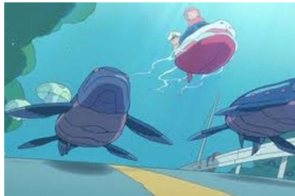
The post-disaster sea teems with ancient marine life

golden sunshine, as if taking place in a marvelous dream world. Lyrical and largely upbeat music, composed by Miyazaki's favorite composer Joe Hisaishi, adds to the magical quality of these scenes. Not only fantasy and dream but time itself plays a role in distancing the viewer from the horror of the real. For, thanks to Ponyo's remarkable powers which have been augmented by her human magician father and sea goddess mother, the sea has devolved back into the Devonian Era of millions of years ago.