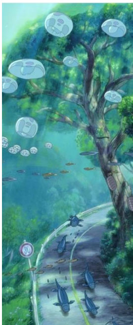
The sea restored

Even more than most films in the genre of disaster and apocalypse, Ponyo allows its audience to both work through the horror of catastrophe and rehearse how to behave when another inevitably comes. The lessons of Ponyo are clear, as embodied in the scene where Sosuke and Ponyo go boating in the Devonian Sea: The current generation of adults have lost their moorings and have allowed environmental devastation and powerful forces of energy to threaten the world. It is up to our children, with their upbeat and pragmatic mindset and who still retain vestiges of respect for and wonder at nature, to stop this threat.