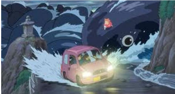
The approaching wall of water in Ponyo

to recede and leaves the port dwellers seemingly miraculously untouched.