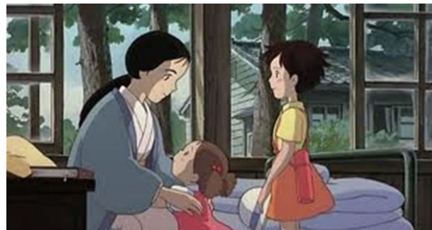
My Neighbor Totoro protagonists Satsuki and Mei visit their mother in the hospital

As such, they may seem quite different from the more intimate family fantasies that Miyazaki also creates. But it is in their privileging of child protagonists and all that the child focalizations imply (i.e. innocence, purity and, as one character in Princess Mononoke puts it memorably, the ability to "see with eyes unclouded") that links them to the more intimate apocalyptic narratives of My Neighbor Totoro and Spirited Away both of which feature children coping with the trauma of parental abandonment.