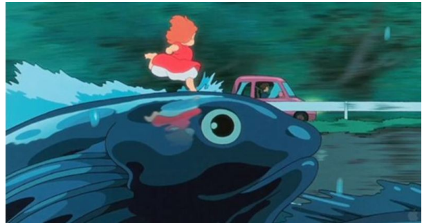
Ponyo unleashes the power of the ocean

collection of magical elixirs and drinking them for herself, another version of the age old fear of tampering with mysterious forces, i.e. technology. Watching this scene in the wake of the March 11 catastrophe one cannot help but be reminded of the waters spilling into the nuclear reactor.