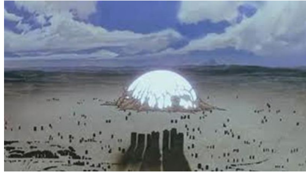
Tokyo shattered in Akira

ifton describes as "the orgiastic excitement of wild forces let loose-destroying everything in order to feel alive." 2 Susan Sontag puts it even more simply as "the pleasure of making a mess." 3 This sense of all-out cathartic release is surely one aspect of why disasters have such a hold on our imaginations. After all, let us remember how transfixed we, or most of us, were by the images of the tsunami washing over Northern Japan. Furthermore, many Western films (especially American and Australian movies) revolve around apocalyptic situations, from films about nuclear anxiety such as Cold War works ranging from Stanley Kubrick's Dr. Strangelove or Sydney Lumet's Fail Safe to the Australian director Peter Weir's vision of environmental collapse in his film The Last Wave . 4 There are of course deeper cultural factors as well. On a universal level world ending visions are at least as old as Zoroastrianism and are deeply embedded in Judeo-Christian and Islamic civilization.