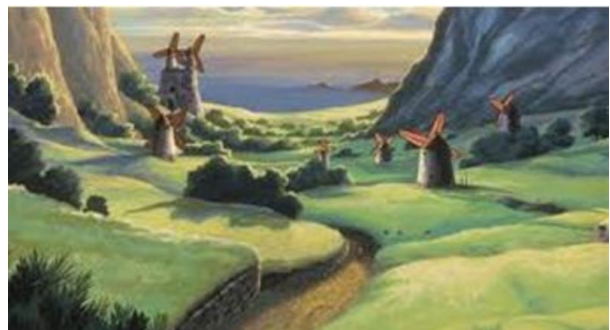
Post-apocalyptic idyll in Nausicaa of the Valley of the Wind

It should be noted that Miyazaki is merely one of many Japanese directors, in both live action and animated films, to explore the subject of catastrophe over the last 60 years. The 1950s film Godzilla and its subsequent sequels worked through the disaster of the atomic bomb while the 1973 blockbuster film Japan Sinks ( Nippon Chinbotsu ) envisions a devastating series of earthquakes and tidal waves that ultimately sink Japan forever beneath the waves. On the anime front, Akira the highest grossing film in Japan in 1989 began with a nuclear explosion that destroys Tokyo. In 1996-7 the iconic television series Neon Genesis Evangelion ( Shinseiki Ebuangerion ) riveted the country with its extraordinary vision of generational conflict on a pathological scale set against an