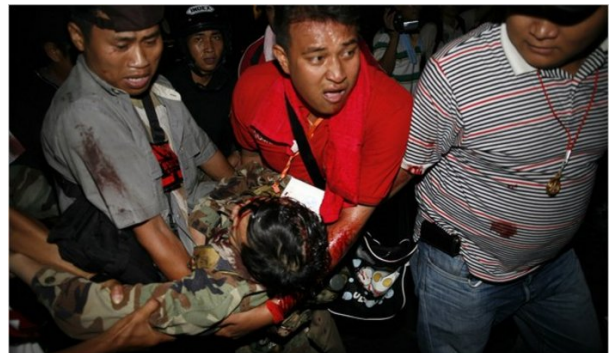
Seh Daeng shot

The sniper shooting of Seh Daeng, Maj. Gen. Khattiya Sawasdipol, on May 13, 2010 by an unknown assailant while chatting with foreign reporters has brought to rupture the standoff between Reds and Yellows in the heart of Bangkok and signals a new stage in the movement and its repression. Seh Daeng, whose nickname means “red commander”, was the reddest of the red shirts. His daughter, who sat at his bedside in the hospital until he succumbed to his grievous wounds on May 17, 2010, has been a staunch supporter of the yellow shirts, illustrative of the convoluted politics of the era. To better put in context the convoluted color-coded politics of the present day, and to identify some of the key heroes and villains and historic reference points being talked about on both sides of the barricades in Bangkok, a brief review of Thai political activism over the years will follow.