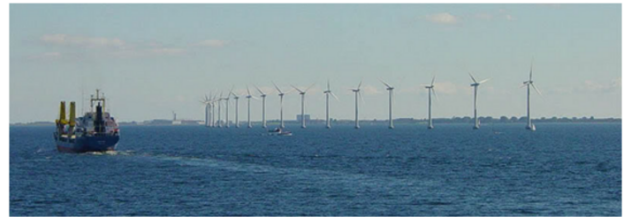
Danish wind turbines

this model broke down due to the change to less favorable policies, and was replaced by larger yearly business investments, opposition to wind power development increased, as the local population no longer had a stake in the wind energy business."