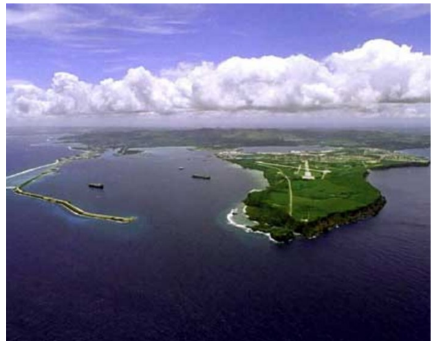
Apra Harbor on the West side of Guam

docking area will be newly constructed to allow for berthing facilities for the large amphibious assault ships that are now stationed at Sasebo: the USS Essex (LHD-2), the USS Juneau (LPD-10), the USS Germantown (LSD-42) and the USS Fort McHenry (LSD 43). Plans appear to be in the works to redeploy these ships from Sasebo to Guam. Moreover, it is likely that the 31st Expeditionary Force, consisting of the Marine combat and logistic units that, to prepare for emergencies, must stay near the landing craft, will also move to Guam from its base in Sasebo. (グアム米軍基地視察報告 2007年8月13日 ( http://www.city.ginowan.okinawa.jp/DAT/LIB/WEB/1/071030_0708013_mayor_2comment.pdf ))