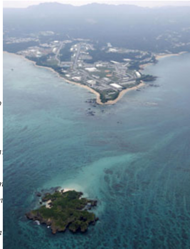
Cape Henoko and Camp Schwab, 2009