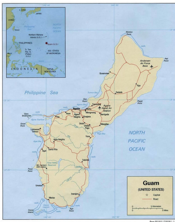
Map and location of Guam

station troops in countries including Japan, Korea, and the Philippines, but after the Cold War, there is no longer a need to station troops in each country, making Guam, located at nearly equal distances within 2000 nautical miles from Japan, Korea, Taiwan, Philippines, and Indonesia, an ideal place to set up a new integrated facility that would allow troops to be withdrawn from bases in Japan and Korea. (グアムの戦略地図 ( http://posts.same.org/JEETCE2007/presentations/2.3Bice.pdf ))