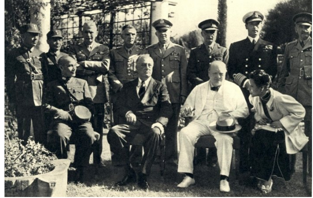
Generalissimo and Madame Chiang Kai-shek flank Roosevelt and Churchill at Cairo

The Allied powers formally addressed the issue of postwar Northeast Asian occupation in Cairo, where the U.S., Great Britain, and China signed a communiqué in December 1943. The three signatories proclaimed for the first time that Japan would forfeit its control over the Korean Peninsula. They also agreed to delay Korean independence by adding the often-quoted phrase, “in due course Korea shall become free and independent.” The Allied leaders declaring that Japan would lose possession of the Korean peninsula marked an important clarification regarding Korea’s post-liberation status. Remarks by American and Japanese officials suggesting that it was a mistake to separate Korea from Japan could be heard both before and after U.S. occupations had begun.