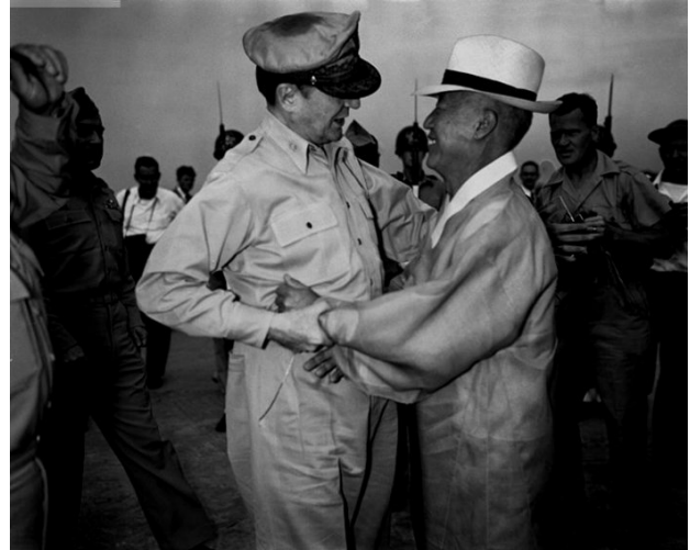
Rhee and MacArthur

Japan-based Koreans suspected of having participated in leftist activities. Those Koreans who returned to the ROK—it was then not possible to repatriate to the newly formed DPRK—faced interrogation, imprisonment, and possible execution. From around this time we see an expanding definition of “communist,” as applied to the Japan-based Korean. General Douglas MacArthur, offered one such example in his disagreement with Japanese Prime Minister Yoshida Shigeru’s 1949 suggestion that all Koreans unable to “contribute to [Japan’s] reconstruction” be forcefully repatriated. Here he remarked that since they were “mostly North Koreans” ( sic ) they “would [all] have their heads cut off” by the ROK government. [47] Labeling this population as “mostly North Korean” was untrue in that the vast majority of Japan-based Koreans came from southern Korean towns. The idea that MacArthur suggested, that most Koreans were DPRK-influenced communists, was also problematic in its assumption that Japan-based Koreans could only adopt this ideology from a foreign influence. This exchange also suggested as a definition of “communist” any Korean unwilling to contribute to Japan’s reconstruction, or, more simply put, a troublemaker. Both leaders neglected to consider why, considering the long history of Japanese discrimination they endured, any Korean would be interested in assisting in Japan’s recovery.