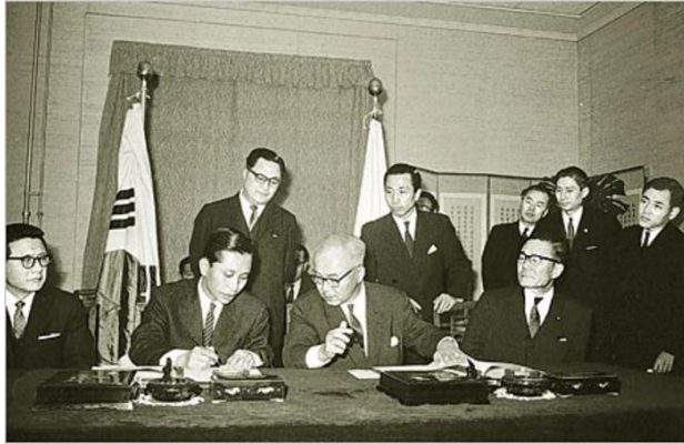
Korean Foreign Minister Lee Tong-won and Japanese Foreign Minister Shiina Etsusaburo sign the Treaty on Basic Relations between Japan and the Republic of Korea on June 22, 1965

Park to demonstrate for terms more equal to Japanese than those they gained by their becoming permanent residents.