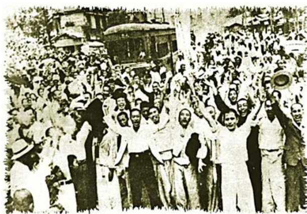
Koreans celebrate independence on August 15, 1945

The August 15, 1945 announcement by the Japanese Emperor declaring Japan's intention to accept the Allied forces' terms of unconditional surrender sent Koreans throughout the empire into the streets in celebration. For the first time in decades they could freely associate with their fellow countrymen, communicate in their native language, and wave their national flag ( taegeukgi ) as Koreans without fear of punishment.[1]