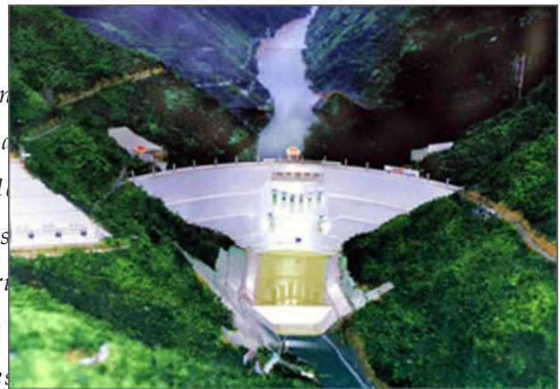
China's Xiaowan dam, the world's tallest, poses a huge challenge to the Mekong river basin countries

The Mekong, one of the world's major rivers, starting in Tibet and flowing through south China, Burma, Thailand, Laos, Cambodia, and Vietnam, provides sustenance through irrigation and fishing to those living in its basin. But it also provides hydroelectric power through dams, three of which were built in China, with more planned. And it is precisely these dams that are now threatening the water supply, the livelihood of those living downstream, and the relations between China and its southern neighbors. A fourth Chinese dam, Xiaowan, that should generate 4,200 megawatts of power, could affect the level of fish stocks in Cambodia and water supply for Vietnam's rice fields. But China contends controlling the water flow will prevent the adverse effects of erosion caused by the Mekong's flooding cycle and will supply renewable energy. Winning the debate or coming to a workable compromise is further complicated by China's refusal to join the Mekong River Commission, an inter-government agency whose members include