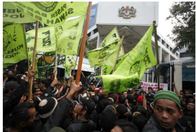
July 6 protest over Ambalat by the Betari Brotherhood Forum in front of the Malaysian Embassy in Jakarta

the incidents to pander to the Indonesian public in the run-up to the July 8 Presidential election. The Indonesian media certainly played up the saber rattling sound bites by Indonesian officials. Indonesian Defence Minister Juwono Sudaryono said "We are undeterred. Let Malaysia send military force and launch propaganda in Ambalat ...". An international relations expert said, "I am supportive of deploying Indonesian warships to Ambalat". Weighing in on the dispute in a rather alarming tone, Vice President Jusuf Kalla said Indonesia must take action and be prepared to wage war.