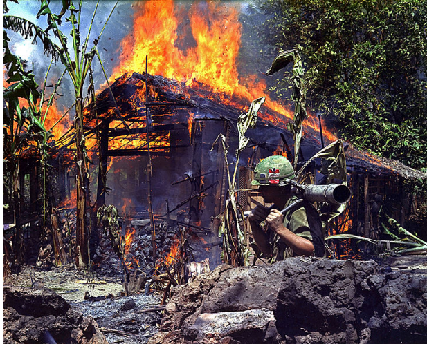
Burning a "Viet Cong base camp" in the Mekong delta, June 3, 1968 at Cai Lay

The sergeant wrote that the unit's policy was to shoot not only guerrilla fighters (whom US troops called Vietcong or VC) but anyone who ran. This was the "Number one killer" of unarmed civilians, he wrote, explaining that helicopters "would hover over a guy in the fields till he got scared and run and they'd zap him" and that the Ninth Division's snipers gunned down farmers from long range to increase the body count. He reported that it was common to detain unarmed civilians and force them to walk in front of a unit's point man in order to trip enemy booby traps. "None [of] us wanted to get blown away," he wrote, "but it wasn't right to use...civilians to set the mines off." He also explained the pitifully low weapons ratio: