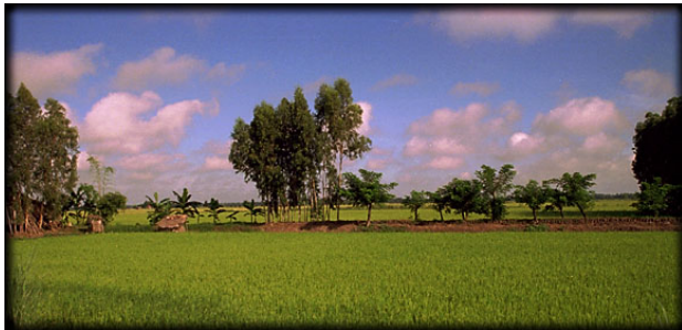
The Mekong Delta, the rice basket of South Vietnam

unpublished interviews with Vietnamese survivors and military officials conducted in the 1970s by Newsweek reporters, as well as fresh interviews with Ninth Division officers and enlisted personnel--I have been able to corroborate the sergeant's horrific claims. The investigation paints a disturbing picture of civilian slaughter on a scale that indeed dwarfs My Lai, and of a cover-up at the Army's highest levels. The killings were no accident or aberration. They were instead the result of command policies that turned wide swaths of the Mekong Delta into "free-fire zones" in a relentless effort to achieve a high body count. While the carnage in the Delta did not begin or end with Speedy Express, the operation provides a harsh new snapshot of the abject slaughter that typified US actions during the Vietnam War.