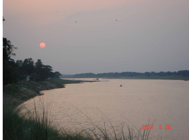
A view of the Brahmaputra River

A Sino-Indian conflict over the sharing of the Brahmaputra waters would begin no sooner than China began to build the world's largest hydropower plant on the river's Great Bend.