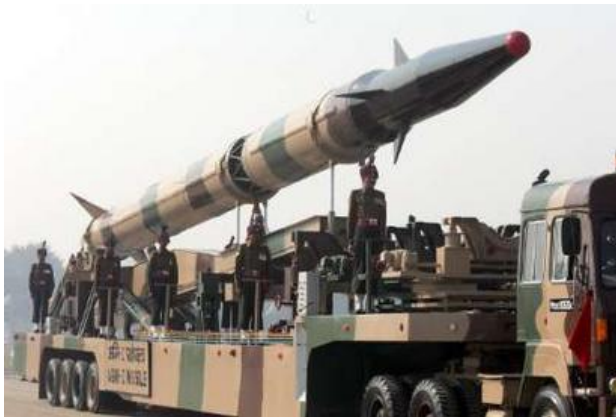
An Agni missile.

The main land-based nuclear delivery system is the Agni series of missiles. Work on the Agni started as part of the Integrated Guided Missile Development Program in 1983, but the missile has been substantially redesigned since the 1998 nuclear tests. The early Agni had both solid and liquid propellants and was never deployed.