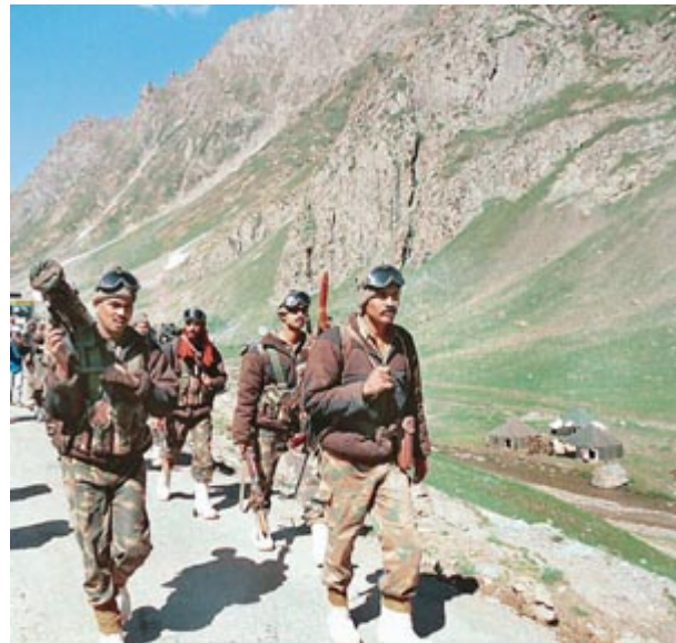
Indian forces in Kargil.

nuclear weapons, no country would risk war. Within a year of the tests, however, India and Pakistan went to war in the Kargil region of Kashmir. Although geographically limited, the war claimed perhaps several thousand lives.