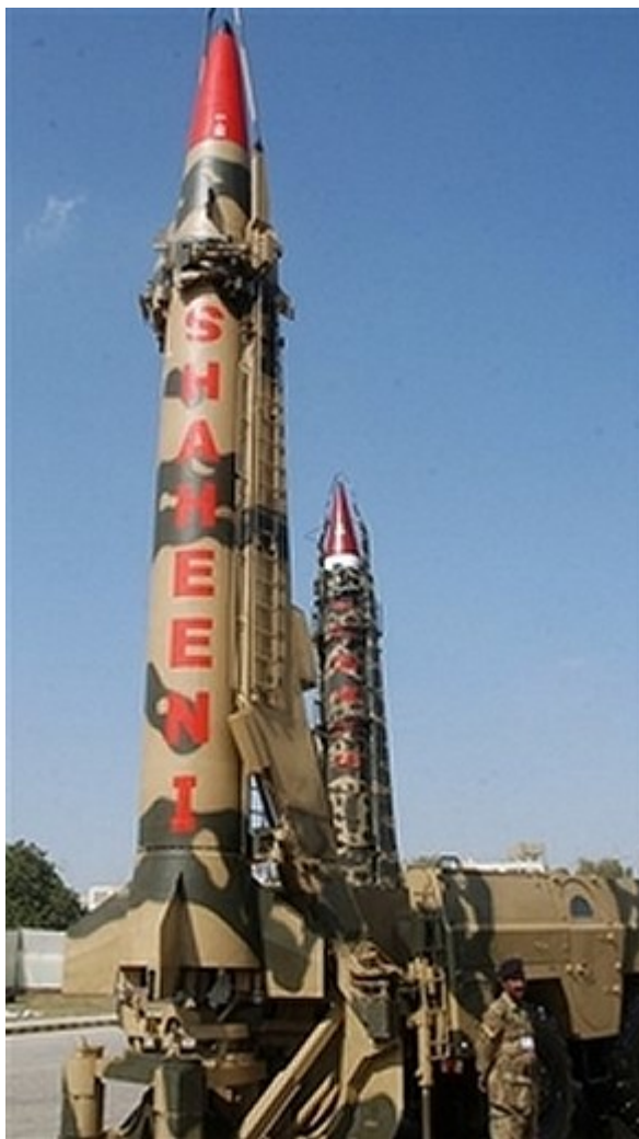
A Shaheen missile.