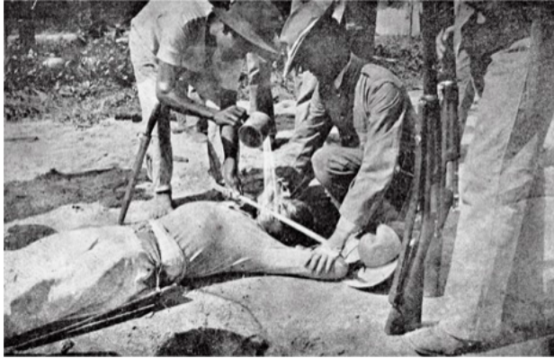
The water cure

Together, the Senate hearings and courts-martial precipitated, by mid-1902, a wide-ranging public debate on the morality of the U. S. military campaign’s ends and means. But the debate was over almost as soon as it had begun since, in July 1902, President Theodore Roosevelt declared the war concluded in victory (in the face of ongoing Filipino resistance) and pro-war Republicans on the Senate Committee shut down the investigation.