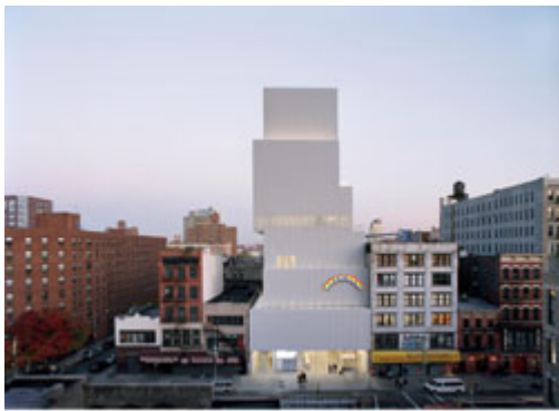
Museum of Contemporary Art opened in Manhattan in December.

In 2004, the 21st Century Museum of Contemporary Art, Kanazawa, a large circular glass structure encasing a random sprinkle of square galleries, opened in that city in Ishikawa Prefecture in rural west-central Japan — and was promptly bestowed with the coveted Golden Lion award at the Venice Biennale for architecture.