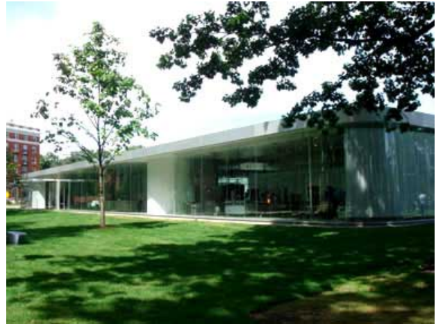
Toledo Museum.

A year earlier, they completed their first major work in Tokyo: the elegant, glass curtain-fronted Christian Dior Building Omotesando in swanky Aoyama. In 2006, along with several buildings in Europe, they finished their first major commission in America, the Toledo Museum of Art's Glass Pavilion, which stunned critics for being perhaps the world's first genuinely transparent museum — both external and internal walls are made of glass.