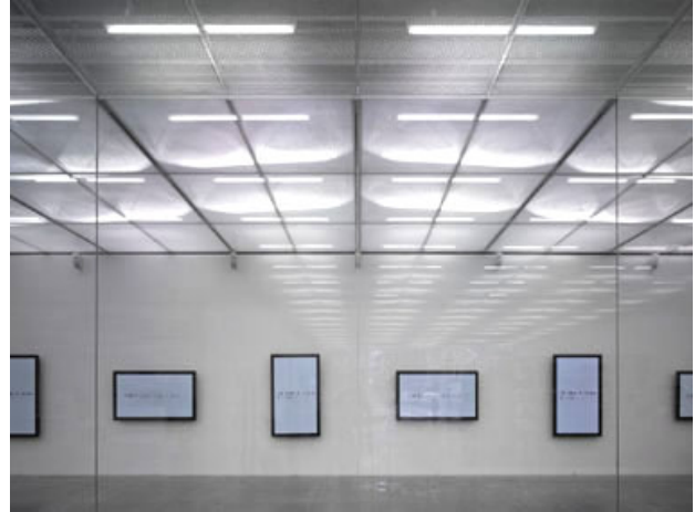
Museum of Contemporary Art interior.

S: The different-sized floors also made terraces on the middle floors possible, and they were important too. In galleries it's difficult to make windows, because you need walls for the art. So we came up with the skylight and terrace idea. Maybe you could put art on the outside terraces, or something. And people can go out there too, and then you can see the New York skyline from an unusual height.