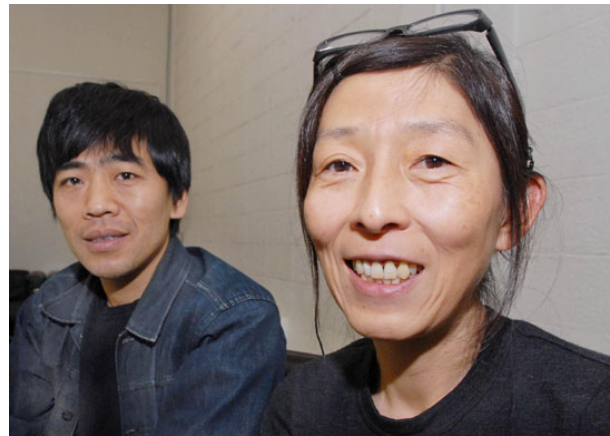
Nishizawa Ryue (left) and Sejima Kazuyo

Being an architect requires patience and endurance. For argument's sake, let's just say it's 2002 and, as the highlight of your career to date, you win the competition to design a new art museum in one of the most prized locations in the world: Manhattan.