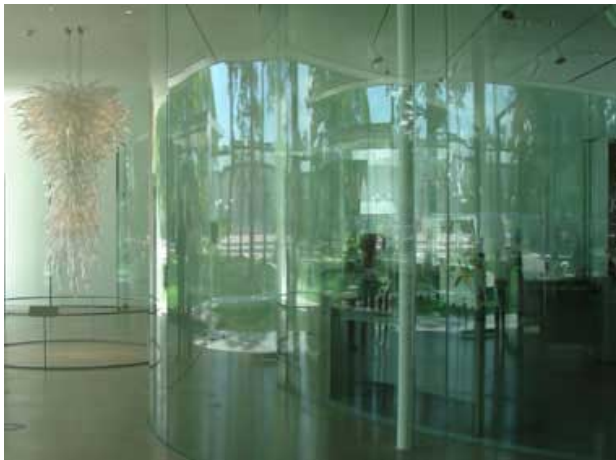
Toledo Museum of Art's Glass Pavilion.

consisted of a single volume, elevated on four pylons.] Seeing that photo left a deep impression on me. But I was really small, and they ended up not building their own house, so that spark of interest was quickly forgotten. Then in Japan when you get to the third and last year of high school at about age 16 or 17, you have to decide on a university course. I remembered about that house that had impressed me so much, and so I applied for architecture. At that point I didn't realize the house was famous, but when I went to university and was in the library I realized that it was.