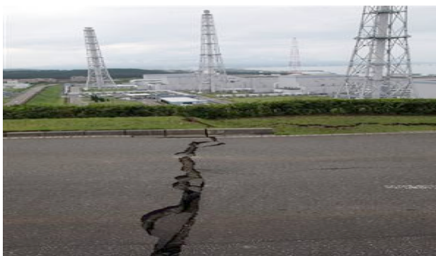
Kashiwazaki after the quake

It is also clear, however, that there was leakage of some 2,000 tons of radiation contaminated water into the Sea of Japan as spent fuel water sloshed over its containment tank and leaked down to a discharge pump. In addition, human error left a damaged turbine gland steam ventilator on, spewing radioactive gas containing cobalt-60 and chromium-51 into the environment for two days following the earthquake.