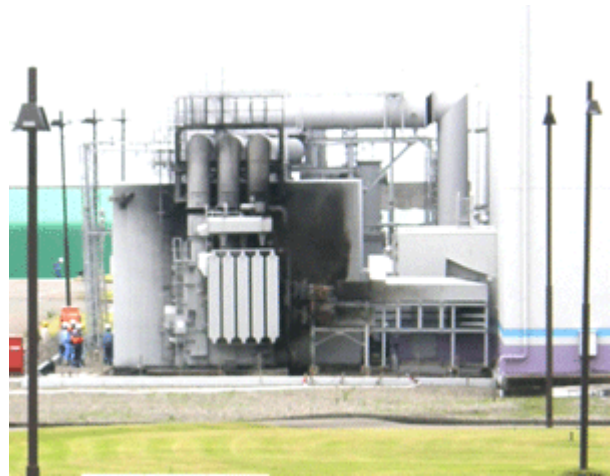
Burnt out transformer at the plant

water pipes also ruptured, making it impossible for plant personnel to fight a fire that broke out in one of the electrical transformers at the power plant. The IAEA also raised concerns about "...the potential interaction between large seismic events and accelerated ageing..." of components and safety equipment.