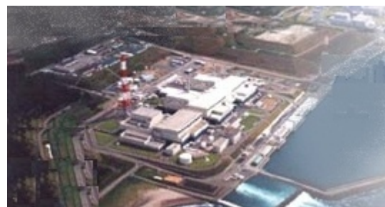
The Kashiwazaki nuclear power plant

In Japan, Kashiwazaki has come to mean "close call". On July 16 a 6.8 magnitude trembler jolted beneath the world's largest nuclear power complex in a place that was not supposed to have a fault. This earthquake serves as a vivid reminder of the risks generated by nuclear power, especially in zones of seismic risk like Indonesia.