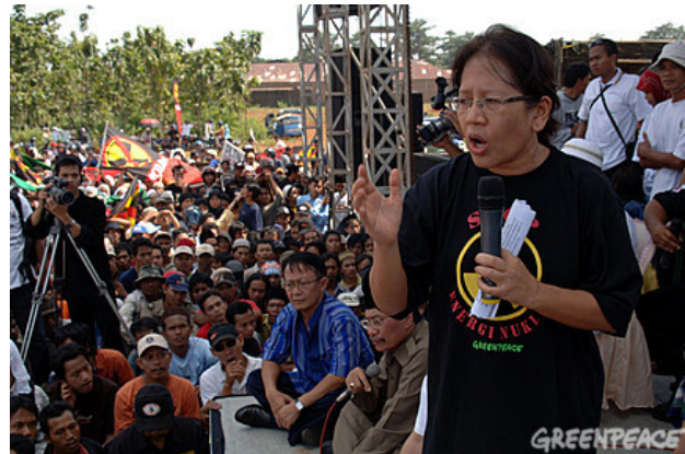
Antinuclear rally on June 13, 2007

Such arguments have not silenced opponents, who point out that only last year an earthquake in southern Java killed more than 5000 people.