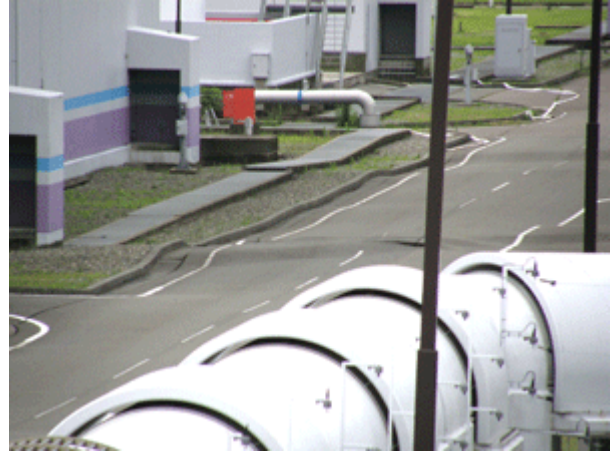
Buckled road at plant site

Industry advocates emphasize the effective functioning of nuclear-related safety equipment and the absence of damage to the reactor buildings. Critics have called on the government to shut down some one-third of the nation's 55 nuclear reactors for more robust inspections to investigate and reassess seismic risks in light of the lessons drawn from Kashiwazaki; the tremors were more than double the design benchmark. Nobody knows how many reactors may have been built on similarly flawed assumptions. The discovery of a fault beneath the nuclear reactors has also raised concerns about relying on power companies to select and assess site suitability. Akira Amari, the METI minister, acknowledged in the aftermath that the government was lax in evaluating TEPCO's pre-construction fault-line survey.