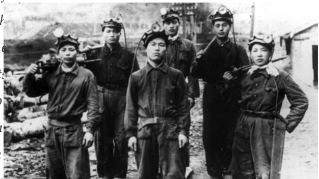
Korean coalminers in Sakhalin

150,000 Koreans were brought to Sakhalin between 1910 and 1945, many of them to work in Japanese coal mines and lumber yards. The latest repatriation efforts are described by the Korean Overseas Information Service in the article below. (Background information on the difficult history of Sakhalin's Koreans can be found at Wikipedia ( http://en.wikipedia.org/wiki/Sakhalin_Koreans ))