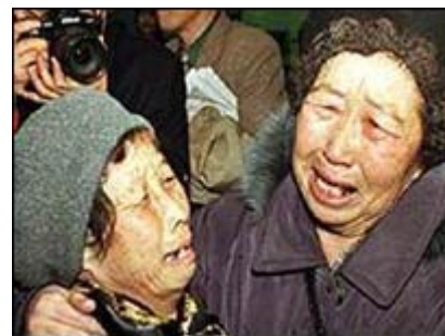
Repatriates to Korea from Sakhalin