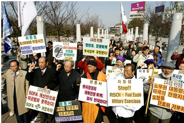
Anti-war, anti-military exercise protest in Seoul on March 12, 2003

from progressive groups in South Korea.[61] The government in Pyongyang has traditionally regarded Seoul as an appendage of Washington, much to the chagrin of South Korea, so if the exercises go ahead Roh Moo-hyun's credibility as a president of the Republic of Korea, independent of America and in command of his own military, would be seriously compromised.[62]