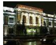
A private Russian bank received the North Korean funds

been the one who has given the bluntest appraisals. Back in March, when the State Department was trying to find a way around Treasury's blocking of the funds it was he who pointed out that "The American side promised to resolve the financial question, and this promise was not fulfilled".[12] Russia can play a significant role in the upgrading of the North Korea railway network, something which could assume major importance if the rejoining of Northern and Southern railways is really taken beyond the technical stage.[13] There have been rumours of a resolution of North Korea's reportedly $8 billion debt to Russia inherited from the Soviet Union and a rail upgrading could resuscitate trade between the two.[14] Nevertheless, for reasons of geography as well as power, Russia carries less weight in the talks than the other countries.