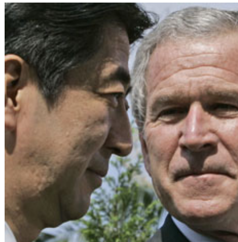
Bush and Abe in Washington

reasons.[18] While Seoul has indicated frustration at Abe's deceitful exploitation of the 'abductee issue' at the talks, Pyongyang has expressed outrage and warned that 'full implementation' of the February agreements depends on Japan as well as the US.[19] However, it is difficult to see what more damage Japan can do. It has cut off trade and the flow of remittances to the DPRK and cracked down on the pro-Pyongyang Korean organisation in Japan. Its ability to have an autonomous effect on the agreement is circumscribed by the US, and here the signals are mixed. During Abe's visit to Washington in April Bush appeared to agree that the DPRK could not be removed from the Terrorism List until Japan was satisfied that the abductee issue had been resolved.[20] Rice, realising that this meant giving Abe a veto over the negotiation process, which he would wield, reportedly stepped in and categorically said that the abduction issue was irrelevant because it did not involve US citizens.[21]