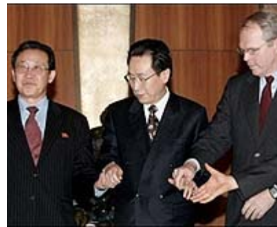
Chinese Vice Foreign Minister Wu Dawei joins hands with North Korean negotiator Kim Gye Gwan and his US counterpart Christopher Hill

Post that there was an unpublished 'side agreement' to the public one in which " the United States promised to resolve within 30 days a Treasury Department case that had frozen North Korean funds at a bank in Macau suspected of distributing dollars counterfeited in North Korea"; that is the BDA.[28] In April the DPRK Foreign Ministry reiterated that they would move to implement the February Agreement "only when lifting of financial sanction proved to be reality." [29]