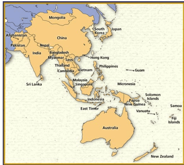
Map of the Western Pacific

Despite centuries of subjugation by larger neighbours—Joseon Korea, Imperial Japan, and South Korea—Jeju island society has maintained a distinct identity and a measure of autonomy. Relations with both Korea and Japan have at times had devastating effects on the islanders, but also contributed to the dynamism of Jeju island society and opened up new routes for islanders to continue traveling as a vital part of their social life.